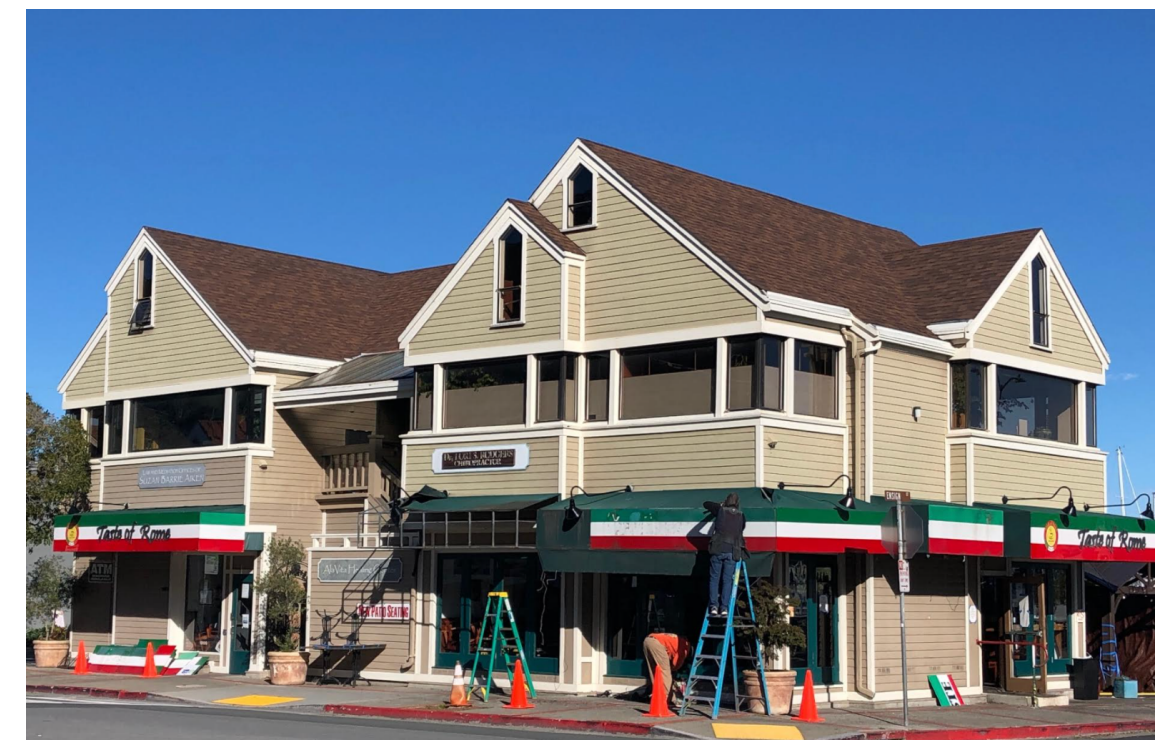
Happy Wednesday, Villagers

Please <u>send along</u> your suggestions for materials to add to the daily tips. We're always looking for good content. And visit our <u>website</u> for more information about our organization and programs.