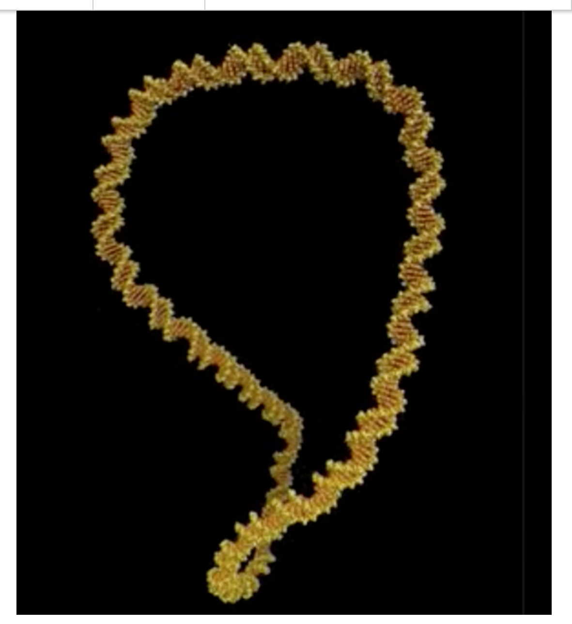
<u>Highest-Resolution Images of DNA Reveal It's</u> <u>Surprisingly Jiggly</u>

Scientists have captured the highest-resolution images ever taken of DNA, revealing previously unseen twisting and squirming behaviors.