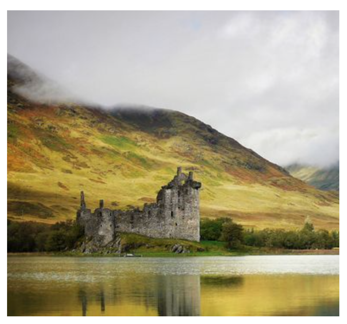
The 28 Most Beautiful Abandoned Places in the World

When the pandemic began, the duo shared their course <u>Creative Photography</u> for Social Media for free. In this course, I learned a bit about their thought process and how they get from an idea to the final result. I was amazed to see that they mainly use simple things to set the scene, often nothing but cardboard or paper!