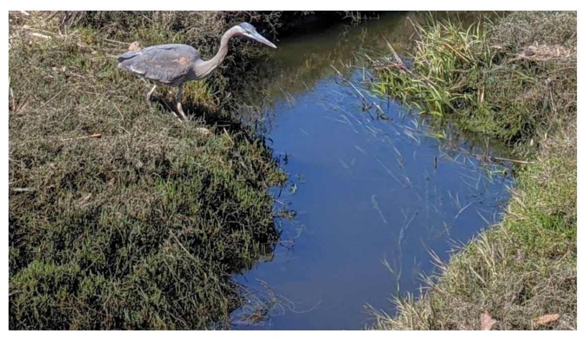
Happy St. Patrick's Day, Villagers

Please send along your suggestions for materials to add to the daily tips. We're always looking for good content. And visit our website for more information about our organization and programs.