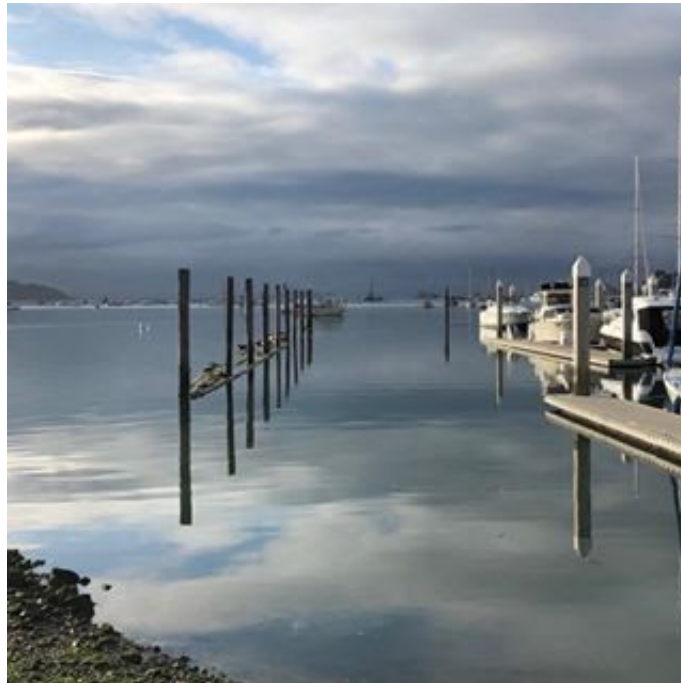
Submit Your Photo For Inclusion In A Future Newsletter