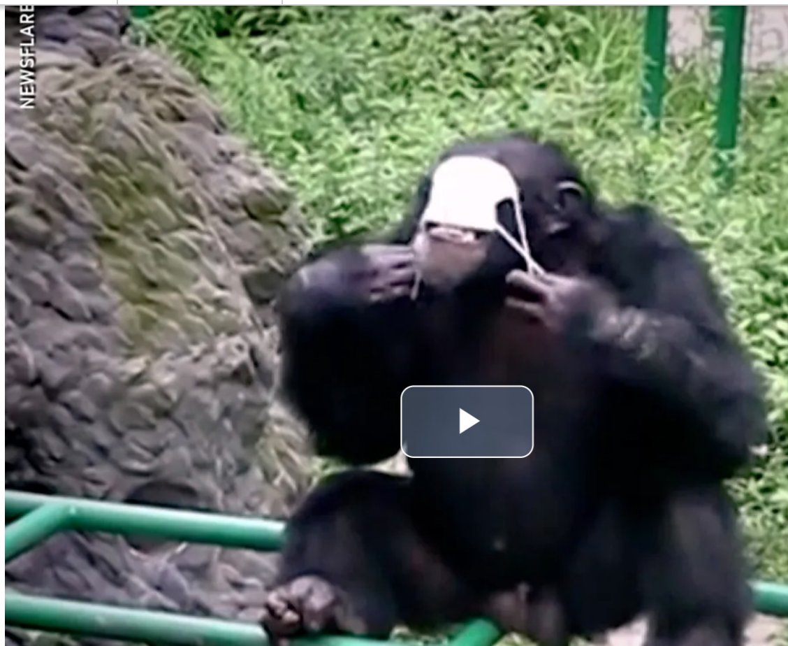
Yu Hui the chimpanzee mimics keeper, washes hands, tries on face mask