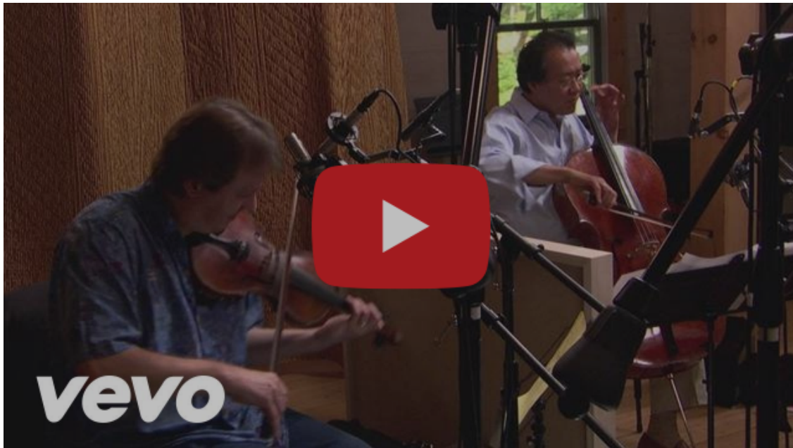
Yo-Yo Ma, Stuart Duncan, Edgar Meyer, Chris Thile - Attaboy (Live)

THE EXHIBITION CHECK AND RETAIL IS POSTPONED DUE TO RAIN!! MOST LIKELY UNTIL JANUARY. WE WILL POST THE NEW DATE ASAP.