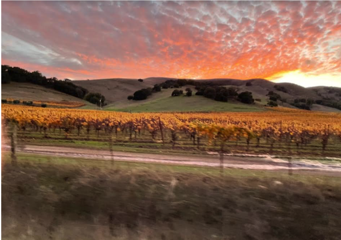
Passenger photo driving out of Sonoma Valley