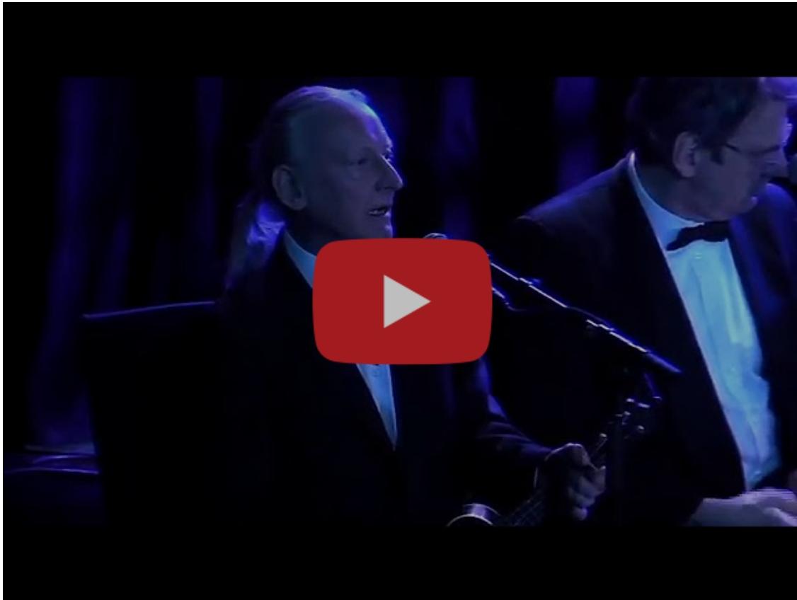
Ukulele Orchestra of Great Britain Live from NYC, 2018 full one hour concert

CARSS is a City of Sausalito Age Friendly Program managed by Sausalito Village. Always looking for volunteer drivers too!