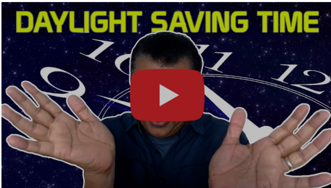
Neil deGrasse Tyson Explains Daylight Savings Time

PLEASE FIND FURTHER INFORMATION ON THE MARIN MASTER GARDENERS WEBSITE . https://marinmg.ucanr.edu//