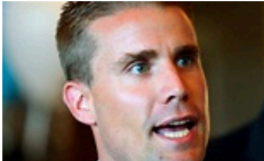
State Senator Mike McGuire

WHAT: Sen. McGuire will be addressing senior issues in the County at the January Commission on meeting