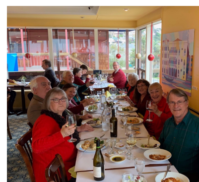
Group sharing Christmas dinner at Aurora

We love pictures of our members at events and around town. Have pictures to share? Email Us!