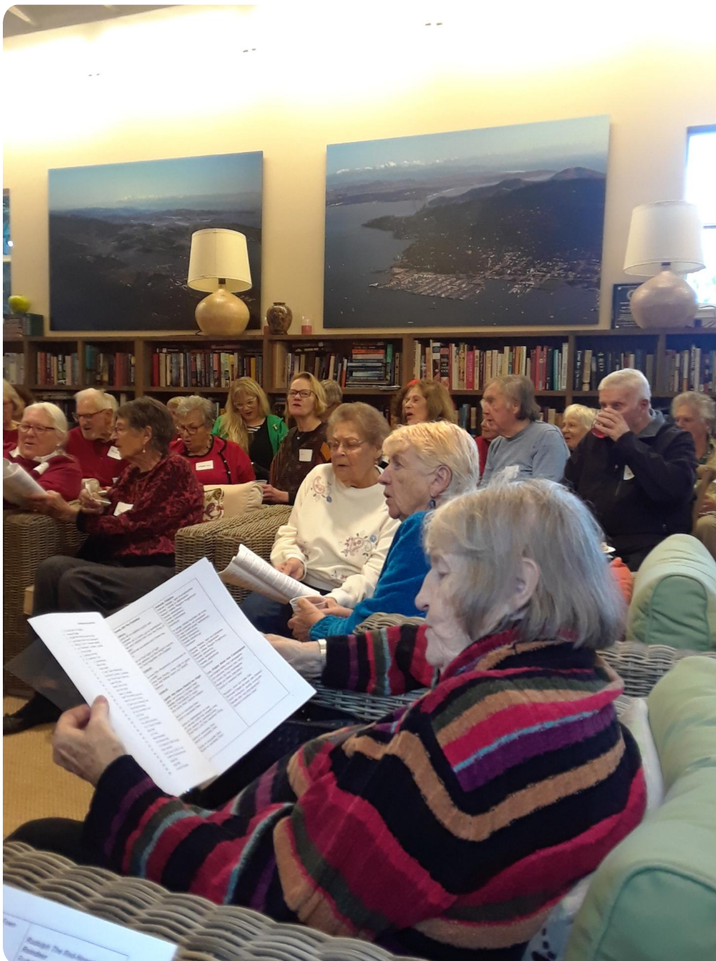
Full house at the holiday sing along!