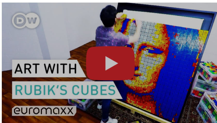
Check out the 'Painting' with Roobik's cubes

If you need a scholarship, please call 415.987.7023