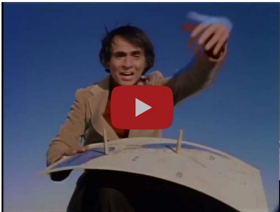
Carl Sagan explains how the Ancient Greeks knew the earth was round