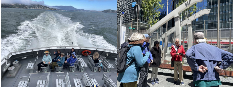
More from the Salesforce Park trip