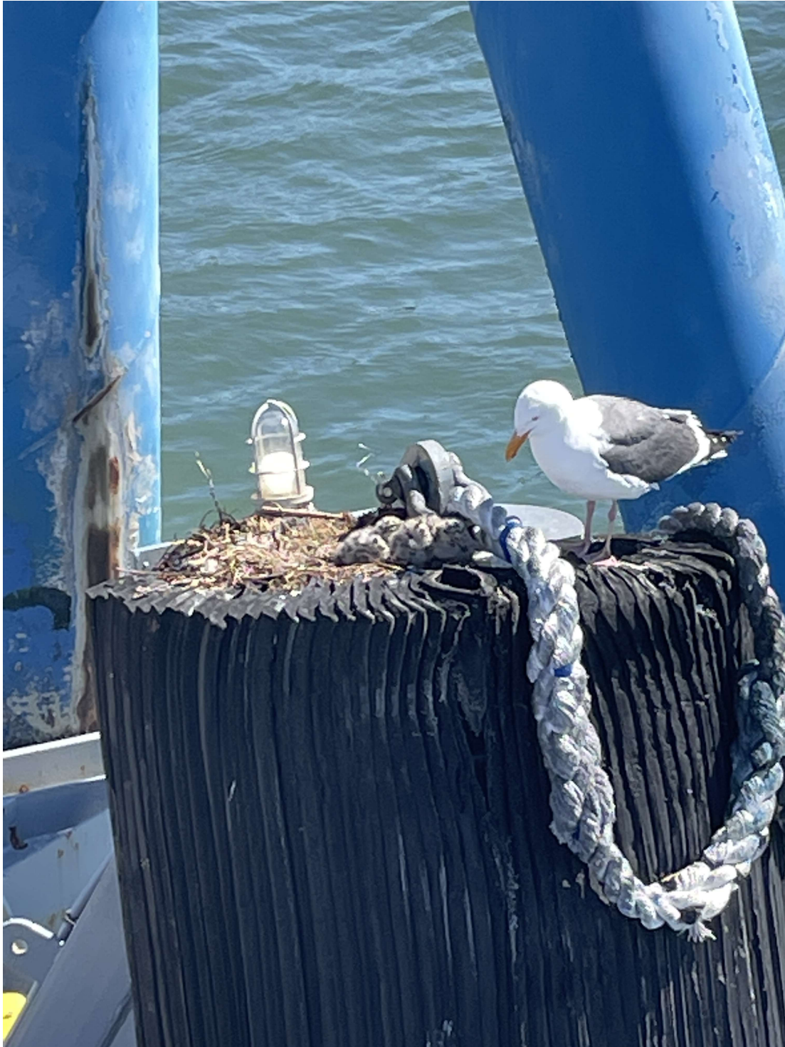
Salesforce Park Trip - baby seagulls at the ferry landing