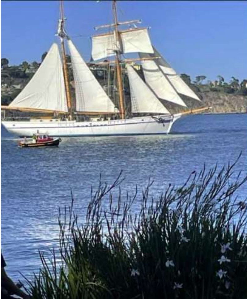
of the Matthew Turner

Send your Bay Area photos to SausalitoVillageTips@gmail.com