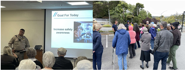
CHP "Age Well, Drive Safe" Class