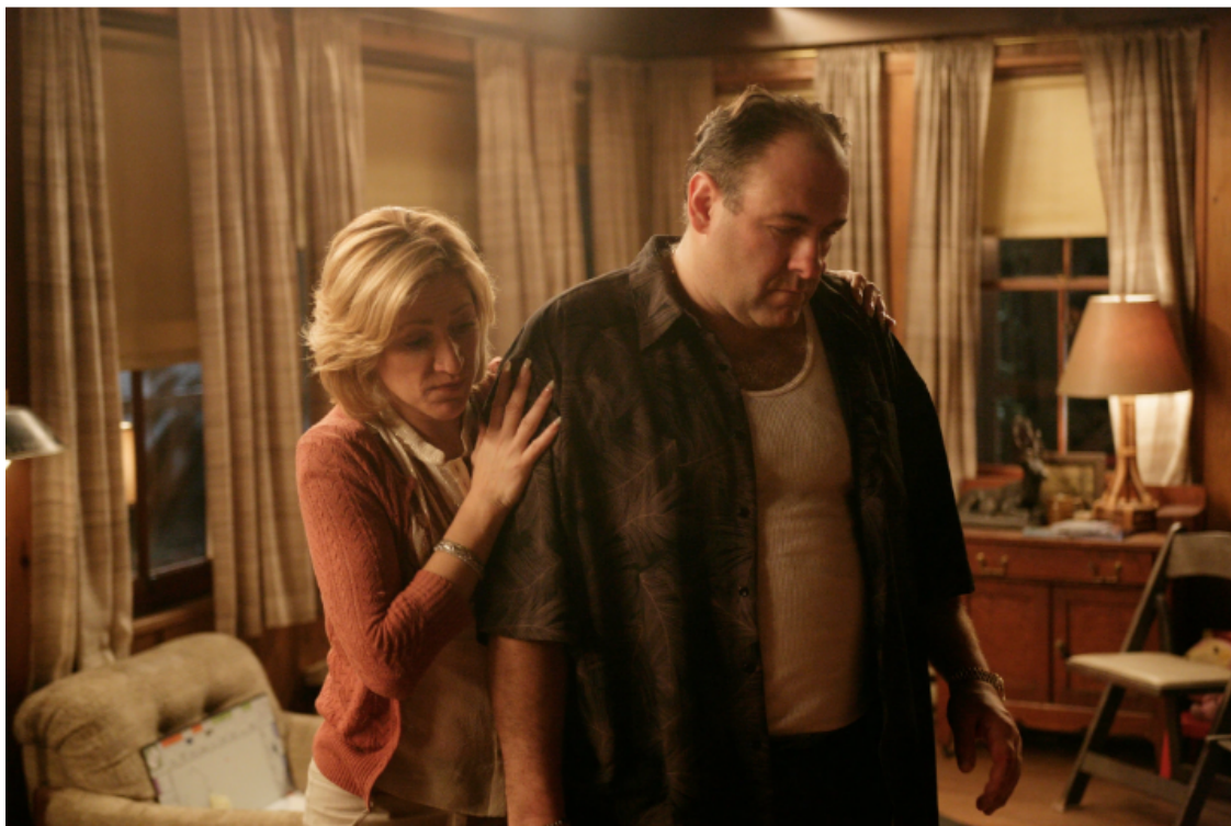
Edie Falco and James Gandolfini in "The Sopranos," which is available for free on HBO streaming platforms until the end of April.

You've done the drive-by birthday party, zoom bar mitzvah, virtual dance party and every single TikTok challenge there is already. So why not dig out that puffy paisley shirt flared pants for a global singalong to the Beatles' Yellow Submarine ?