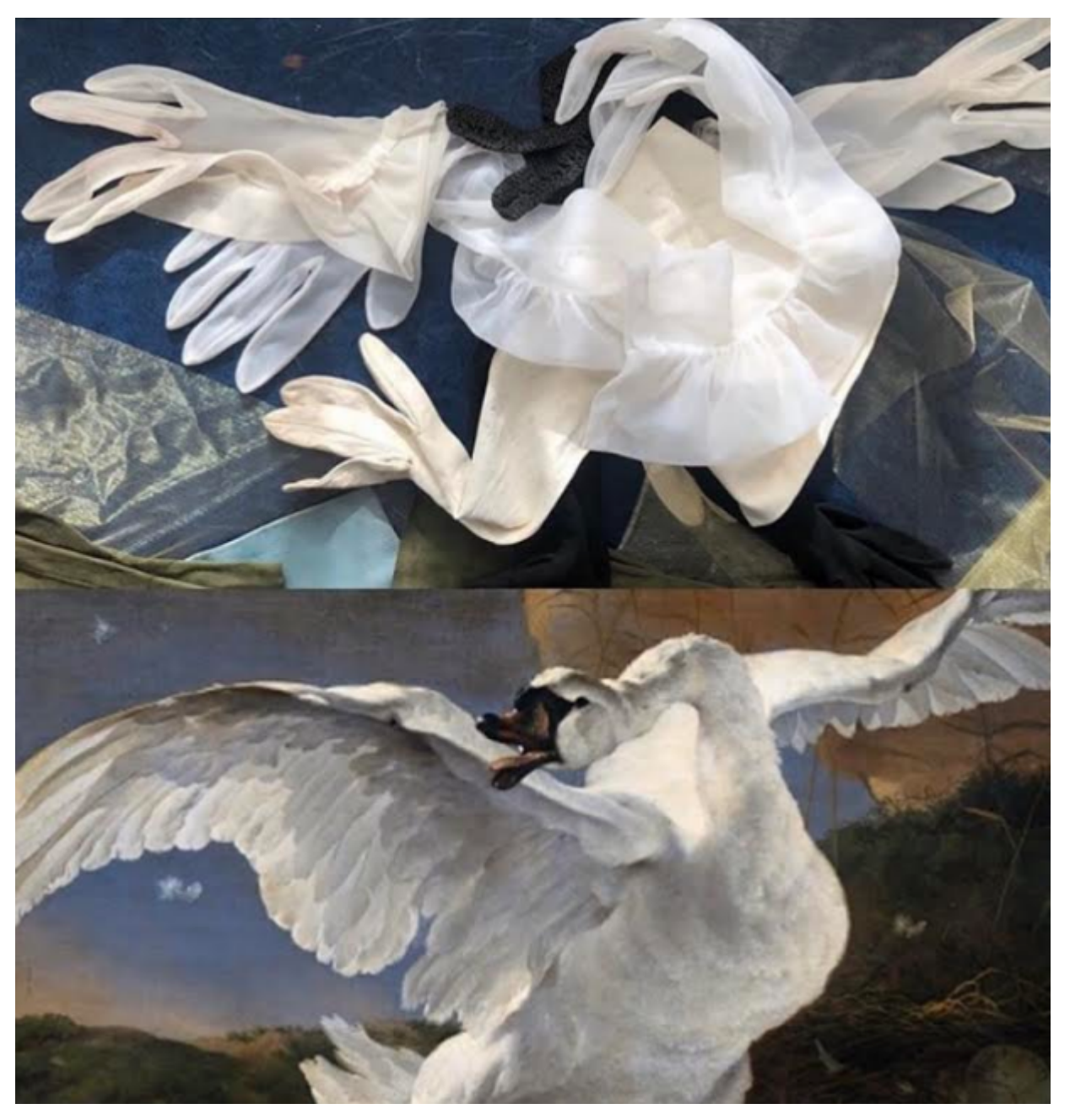
Happy Tuesday, Villagers

We're always looking for new tips! Drop us an email.