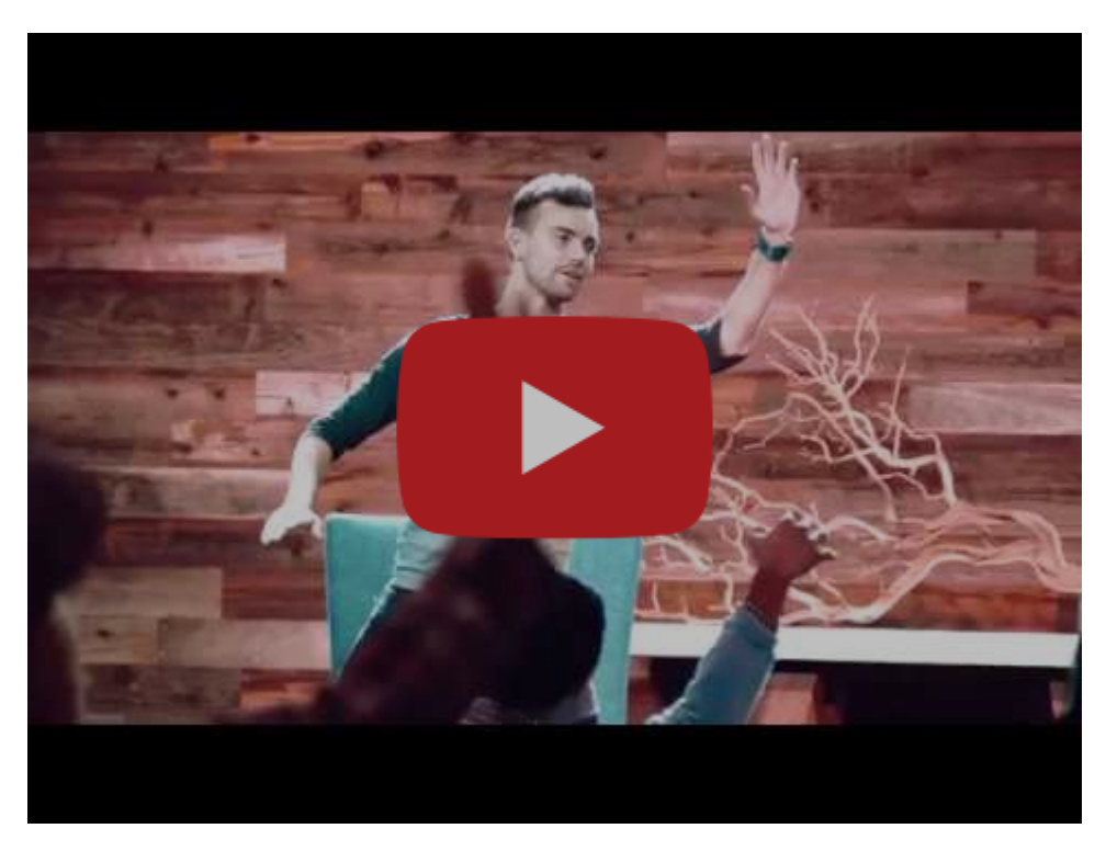
For Your Body