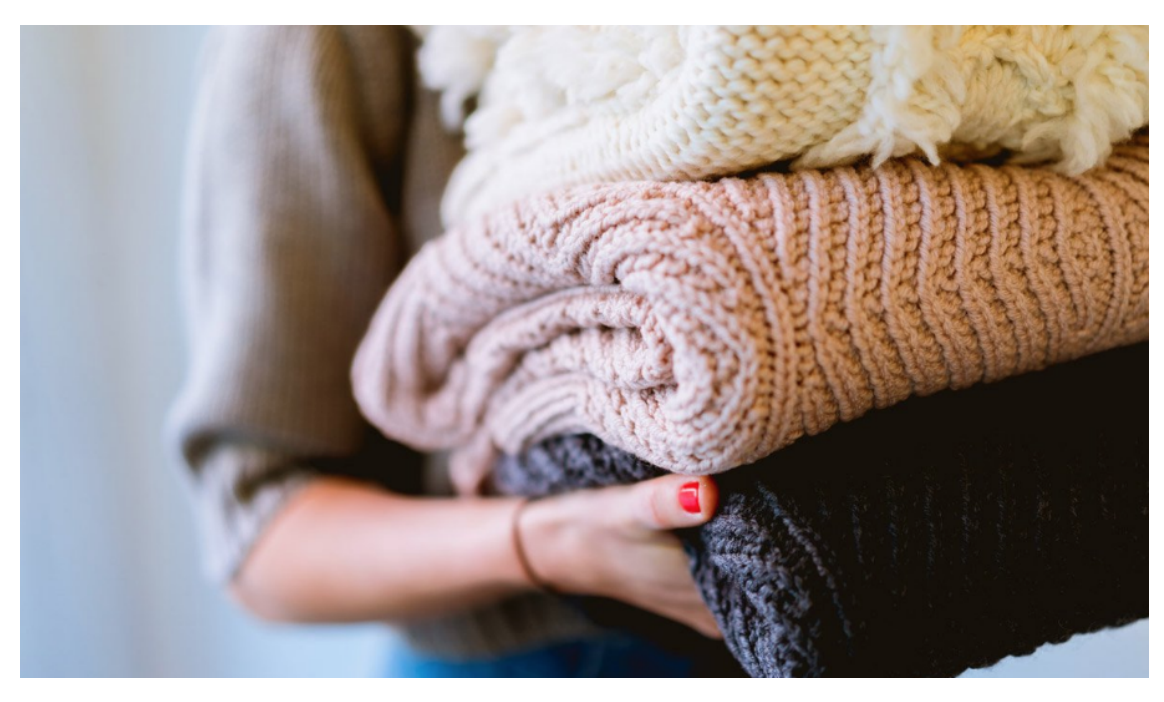
Spring Cleaning: How To Turn Your Trash Into Treasures