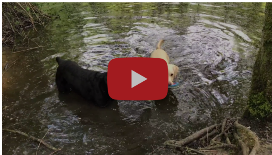
The Walk of Shame