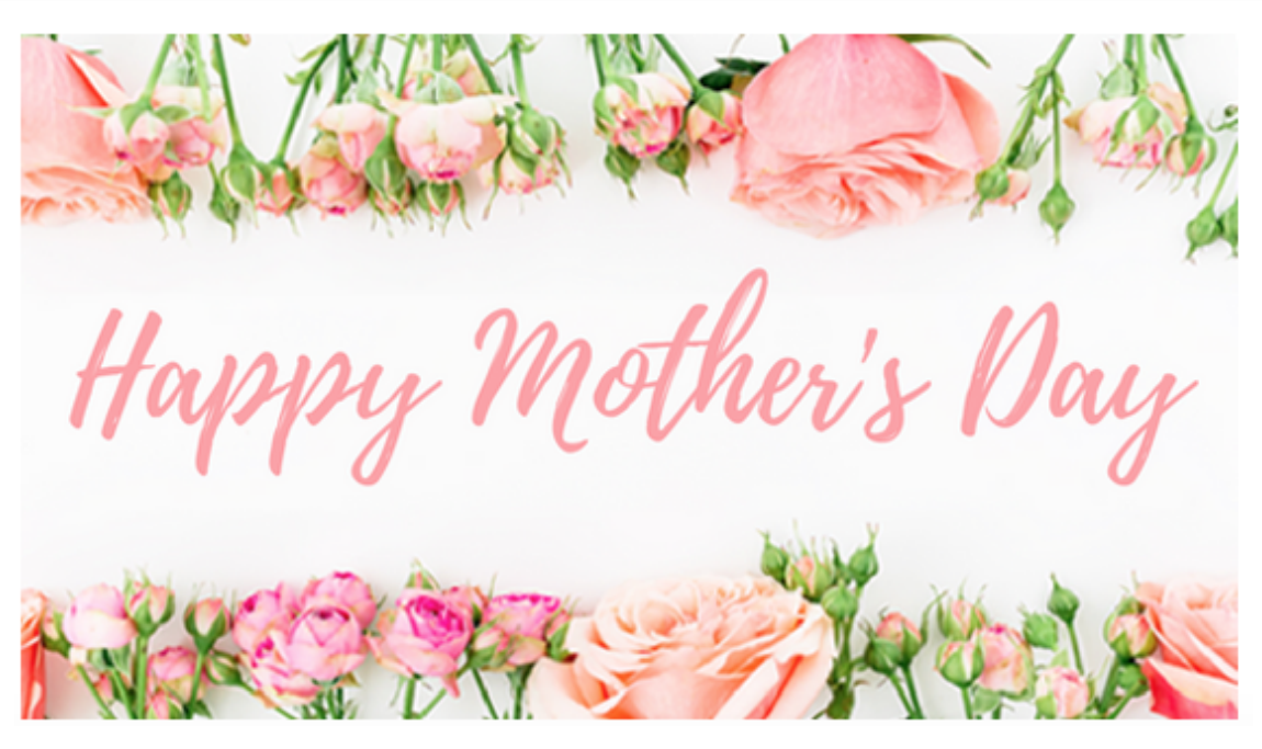
Happy Mother's Day, Villagers

Please send along your suggestions for materials to add to the daily tips. We're always looking for good content.