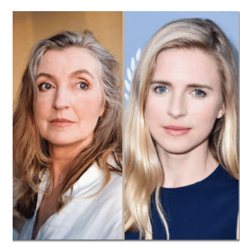
City Arts & Lectures

Europe's long and varied coastline is dotted with settlements whose inhabitants have, for centuries, made their living from the sea. Today, many feature historic mansions, charming <a href="historic squares">historic squares</a> and quaint harbors that draw as many tourists as fishermen. Though some have grown into cities, others are constrained by the physical landscape to remain impossibly beautiful coastal towns.