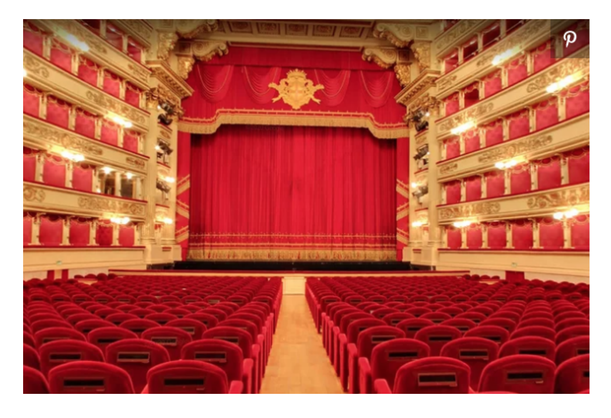
Go Behind the Scenes at One of the World's Most Beautiful Theaters With an Insanely In-depth Virtual Tour

Please send along your suggestions for materials to add to the daily tips. We're always looking for good content.