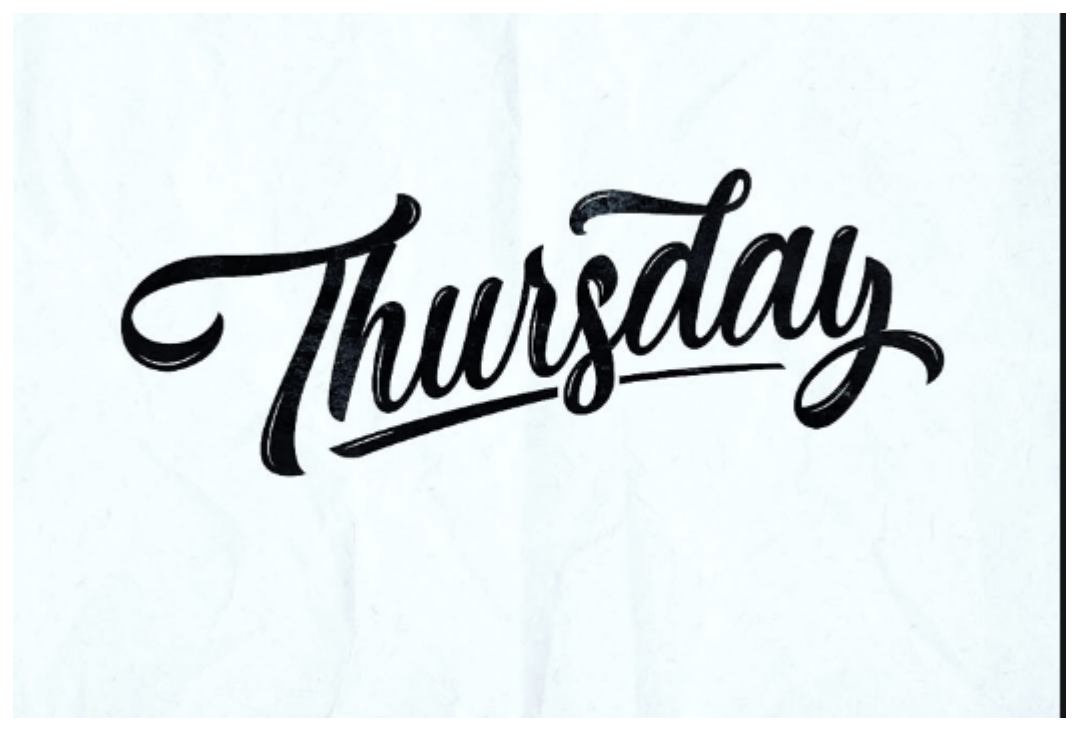
Happy Thursday, Villagers

Please <u>send along</u> your suggestions for materials to add to the daily tips. We're always looking for good content. And visit our <u>website</u> for more information about our organization and programs.