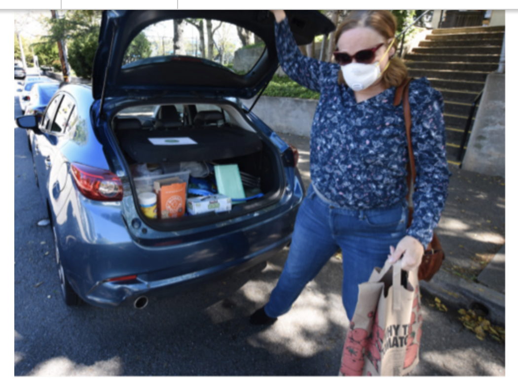
CARSS needs your donations now!

The City of Sausalito has historically included the program in their budget. However, due to the pandemic, the City is facing a $4 million dollar deficit and we need to look elsewhere for CARSS funding. We need to raise a minimum of $20,000 by July 1, 2020 to keep CARSS operating through the next fiscal year.