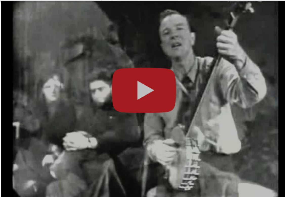
Pete Seeger: Where Have All The Flowers Gone