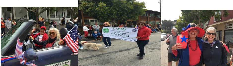
Photos from July 4, 2016