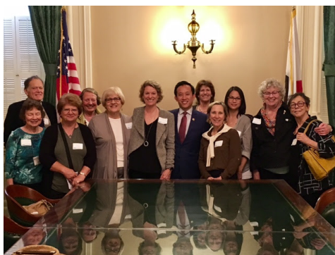
Assemblyman Chiu and Village members in Sacramento

On Thursday, May 18th, 14 representatives from Bay Area villages convened in Sacramento to meet with their elective members of the State Assembly and Senate. The goal for 'Village Day at the Capitol' was to educate our electeds about the importance of the work that villages do in their communities and what a cost savings this can be to the State.