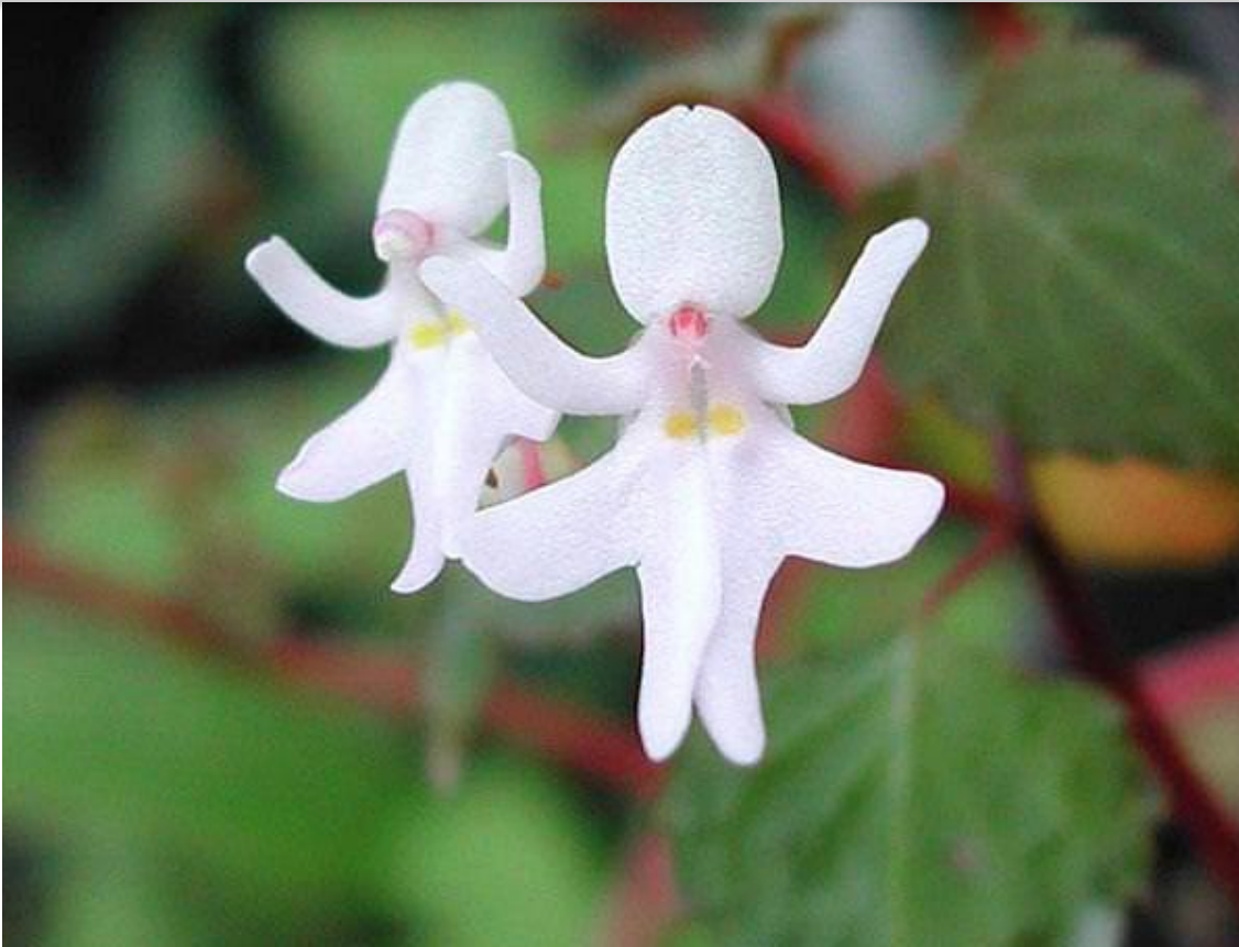
From Flowers that even Darwin can't explain: Dancing Girls (Impatiens Bequaertii)