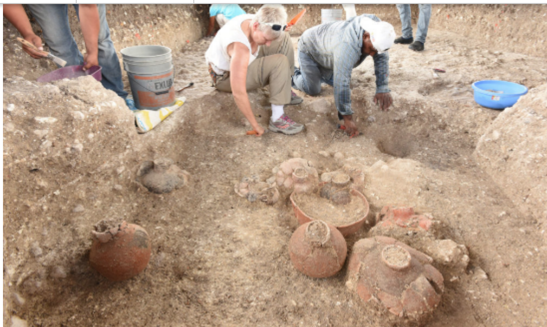
Daniela Triadan (center) excavating with multiple ceramic vessels at Aguada Fenix.