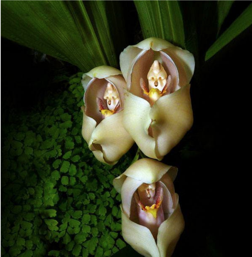
Flowers that even Darwin couldn't explain