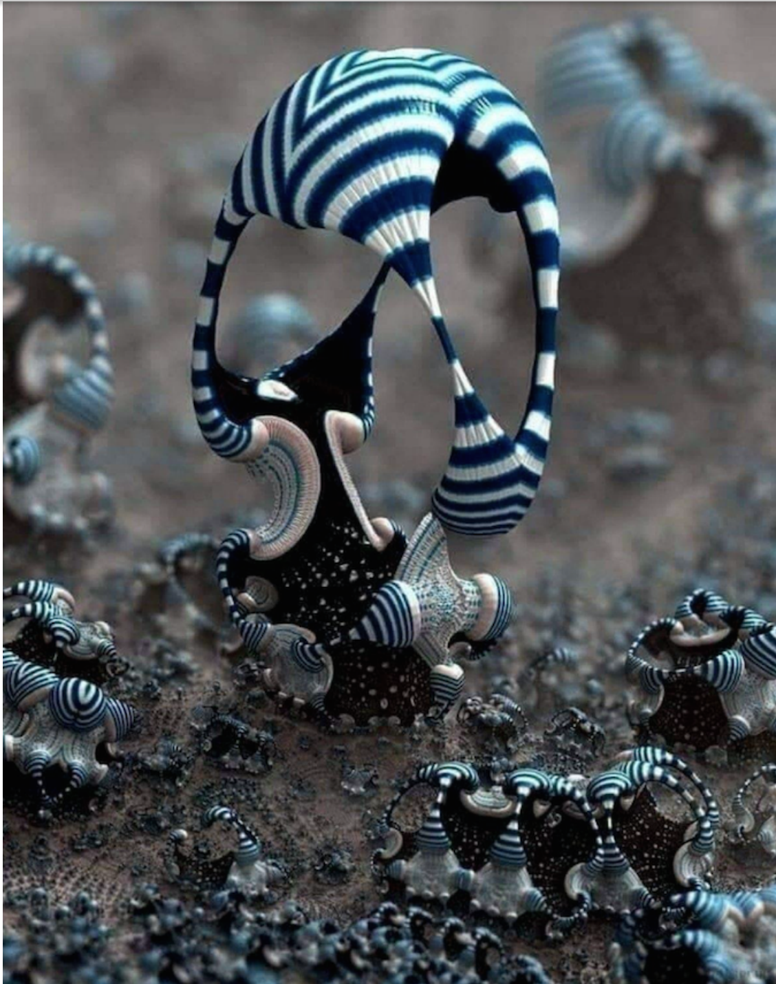
A rare coral from the Galapagos.