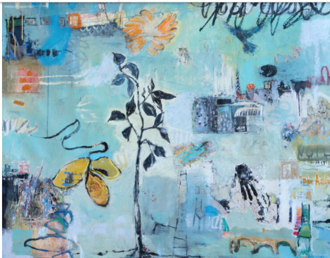
"Love From the Roots", 56" x 64", acrylic, oil and mixed media on unstretched canvas