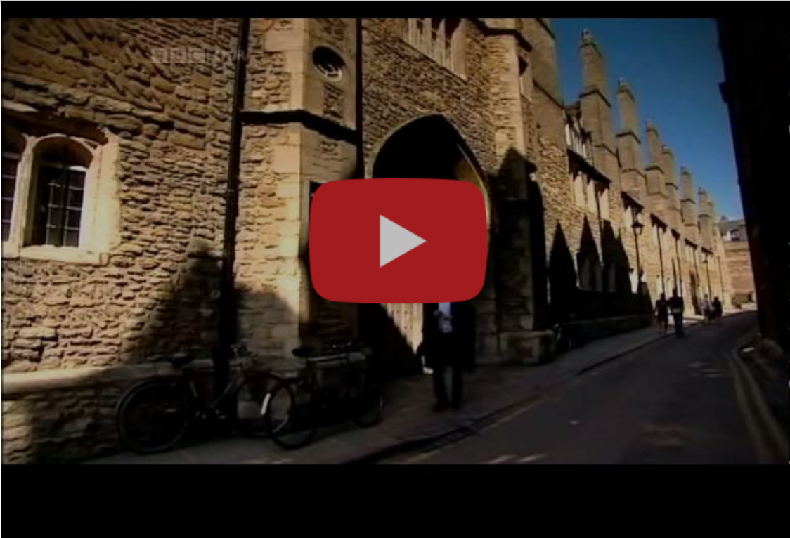
The art of Cornwall