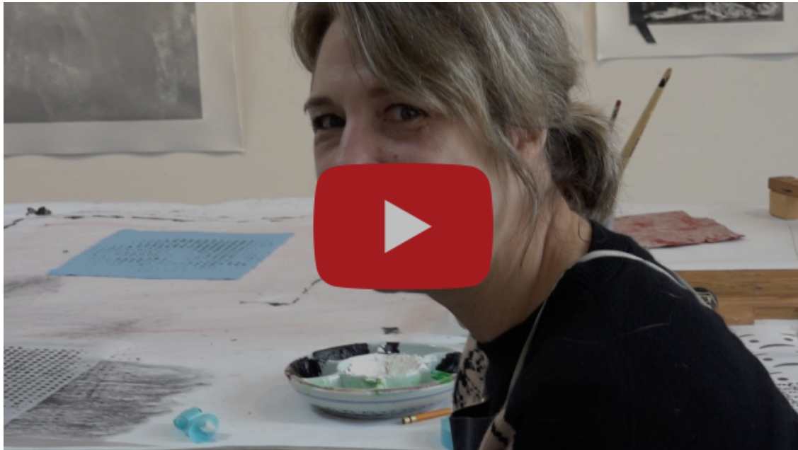
Jacqueline Humphries: Etching Now, 2016