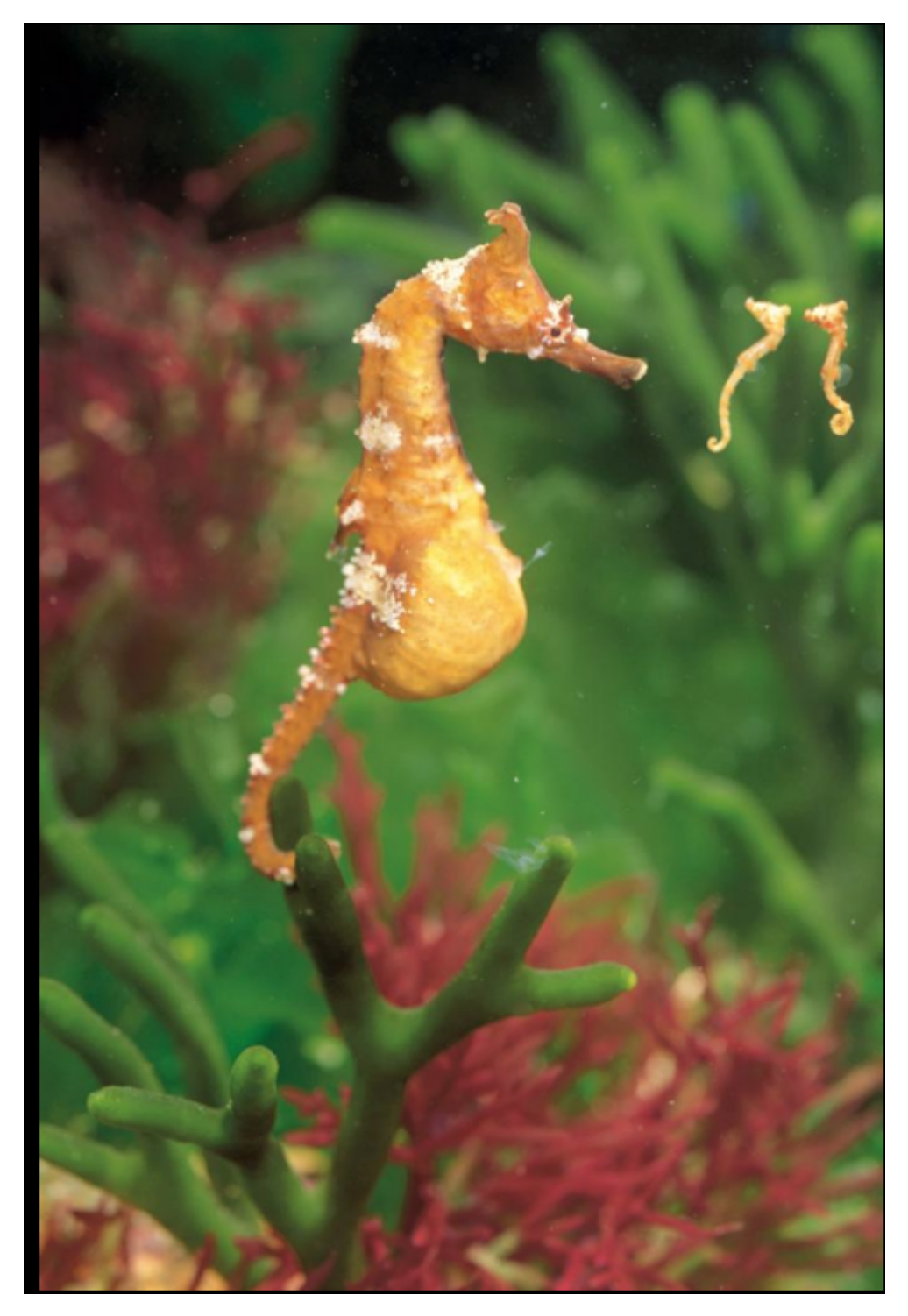
Happy THURSDAY, Villagers

Please <u>send along</u> your suggestions for materials to add to the daily tips. We're always looking for good content. And visit our <u>website</u> for more information about our organization and programs.