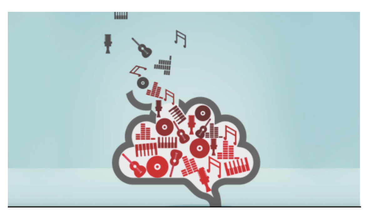
The Power of Music on Your Brain

Music is often referred to as the universal language that transcends cultural and generational boundaries. Not only do we hear music, but we feel it too. You can dance to it, sing with it or play a musical instrument. Music is quite powerful. It ignites our emotions and its positive affects on the brain are far reaching. Discover the many ways music influences your brain and overall well-being