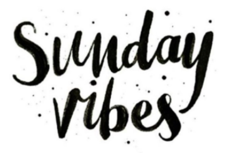
Happy Sunday, Villagers

Please <u>send along</u> your suggestions for materials to add to the daily tips. We're always looking for good content. And visit our <u>website</u> for more information about our organization and programs.