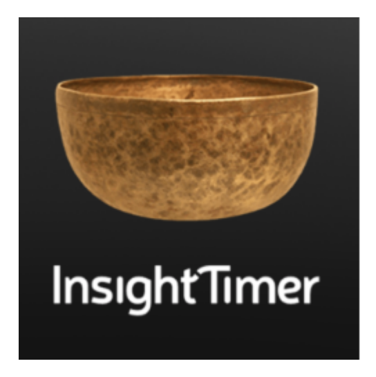
Insight Timer Live: Revolution in Consciousness, with Tara Brach July 2, 2020 | 10 am EDT - Register Now

A free, interactive online summit to help all of us deepen and sustain resilience so that we can meet the immense challenges we face with wisdom and compassion.