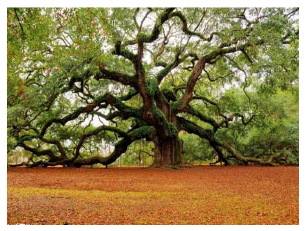
Happy Wednesday, Villagers

Please <u>send along</u> your suggestions for materials to add to the daily tips. We're always looking for good content. And visit our <u>website</u> for more information about our organization and programs.