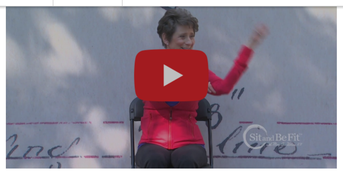
An episode of Sit and Be Fit.