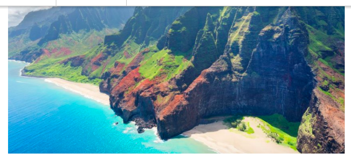
7 Best Trips to Take With Your Partner

Those who <u>travel together</u>, stay together. Whether that's true or not, experiencing the world with your significant other by your side definitely creates an everlasting bond. Whether you love hitting the hiking trail or just spending a cozy night indoors, discover the perfect trip for you and your significant other.