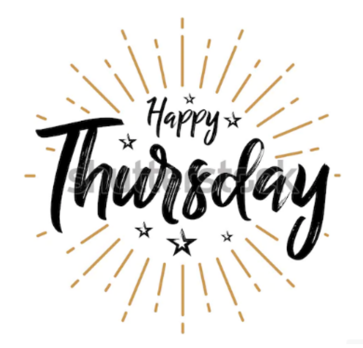
Happy Thursday, Villagers

Please <u>send along</u> your suggestions for materials to add to the daily tips. We're always looking for good content. And visit our <u>website</u> for more information about our organization and programs.