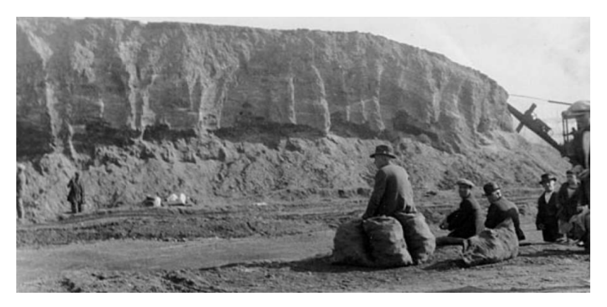
There Were Once More Than 425 Shellmounds in the Bay Area.