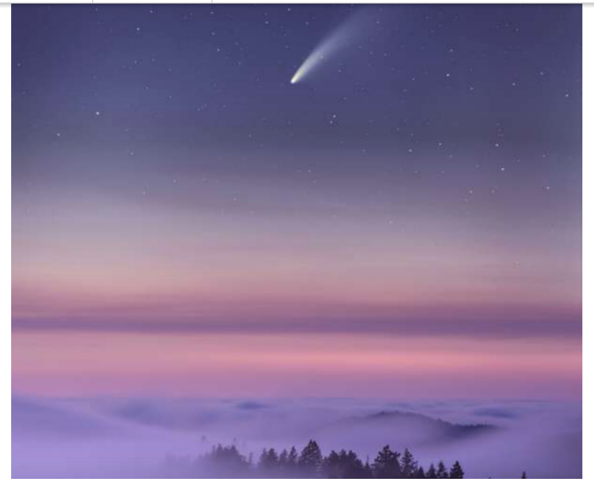
Comet Neowise above Mount Tamalpais in Marin County.