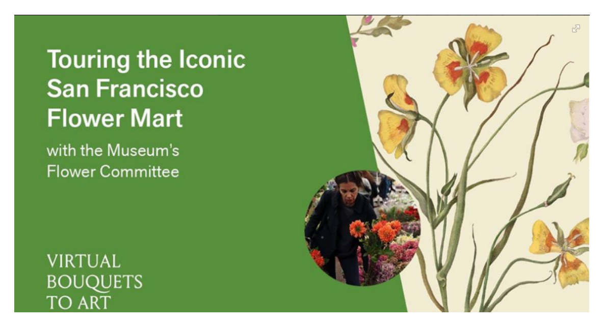
Touring the Iconic San Francisco Flower Mart