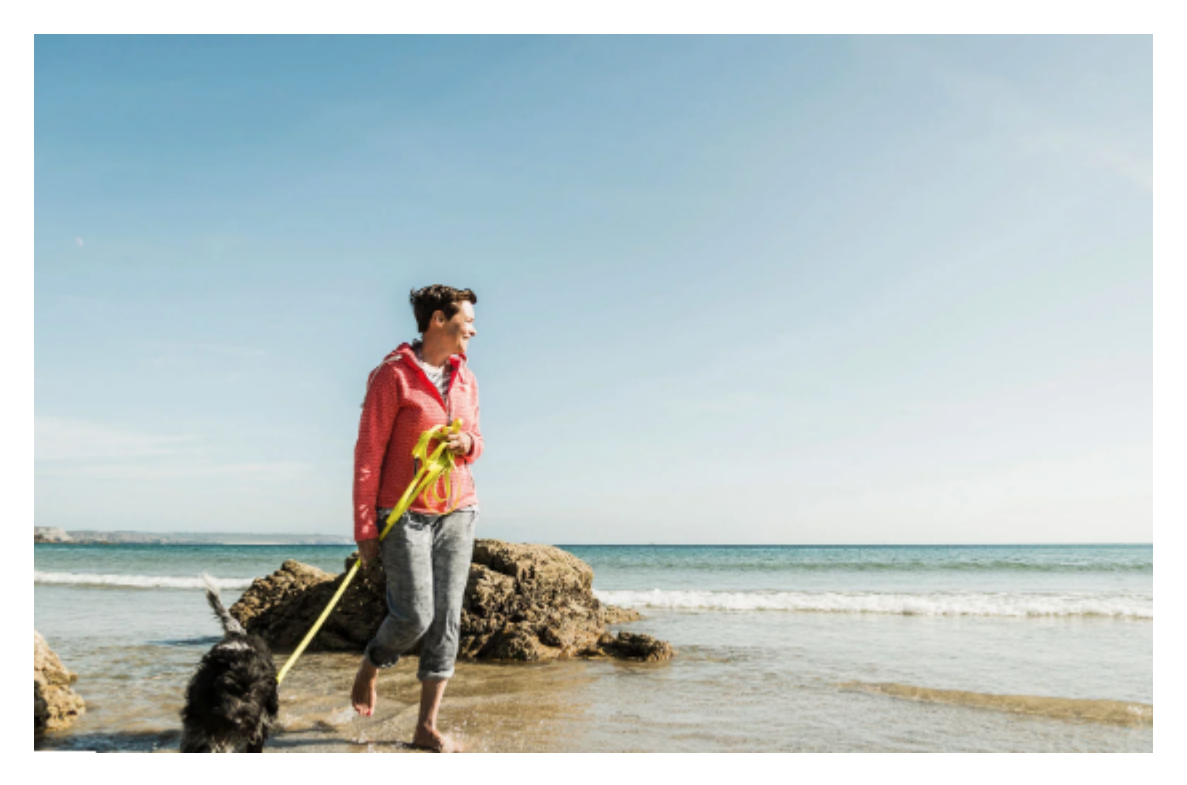
A Short Walk on the Beach Can Improve Your Mental Health

If you haven't had an opportunity to see nature's exhilarating, captivating northern lights (also known as Aurora Borealis), make sure you add it to your bucket list. The northern lights occur when charged particles from the sun enter the earth's atmosphere and collide with gaseous particles. The collisions create stunning light shows in a variety of colors 50 to 400 miles above the earth's surface. Waves of vibrant green and pink are the most common sights, although you'll occasionally see violet, red, blue, and yellow waves.