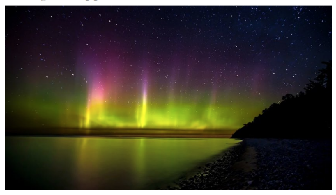
Happy Friday, Villagers

Please <u>send along</u> your suggestions for materials to add to the daily tips. We're always looking for good content. And visit our <u>website</u> for more information about our organization and programs.