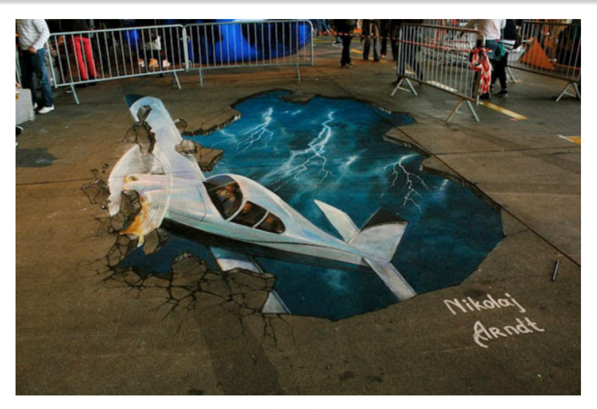
Happy Wednesday, Villagers

Please <u>send along</u> your suggestions for materials to add to the daily tips. We're always looking for good content. And visit our <u>website</u> for more information about our organization and programs.