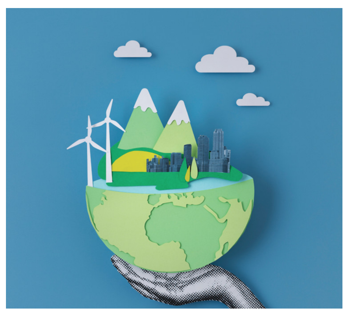
5 Marin Organizations Battling Climate Change