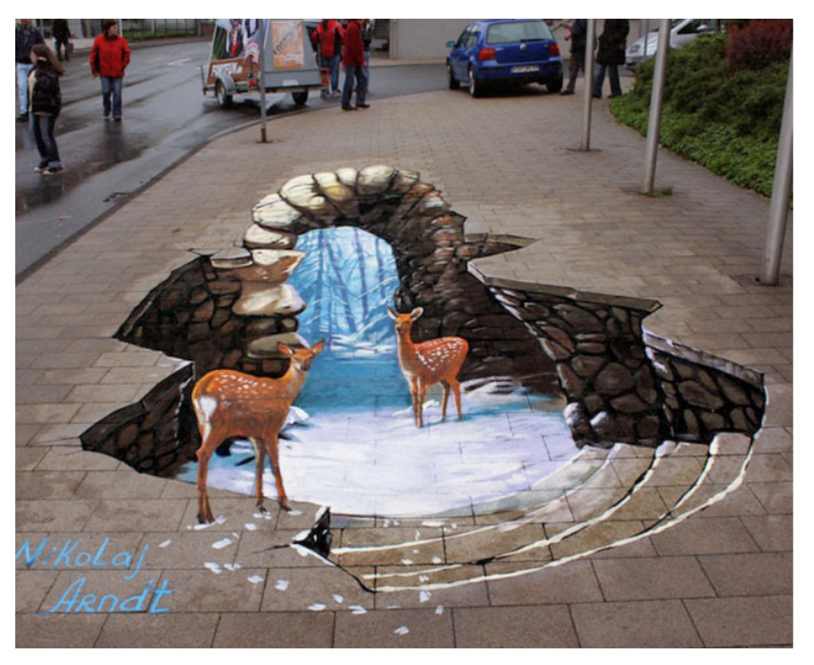
Happy Thursday, Villagers

Please <u>send along</u> your suggestions for materials to add to the daily tips. We're always looking for good content. And visit our <u>website</u> for more information about our organization and programs.