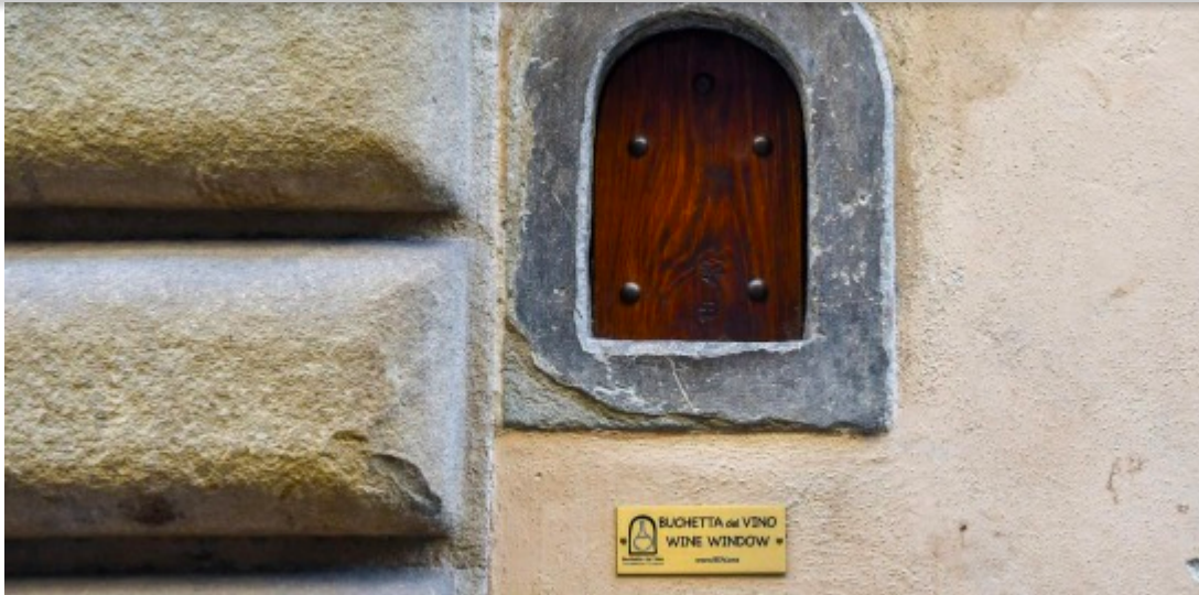
A wine window, used for the sale of wine directly on the street, on the façade of Palazzo Mellini Fossi, Florence.