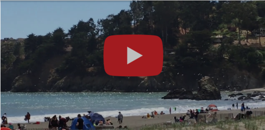
White Birds at Muir Beach. Harrie Schwartz