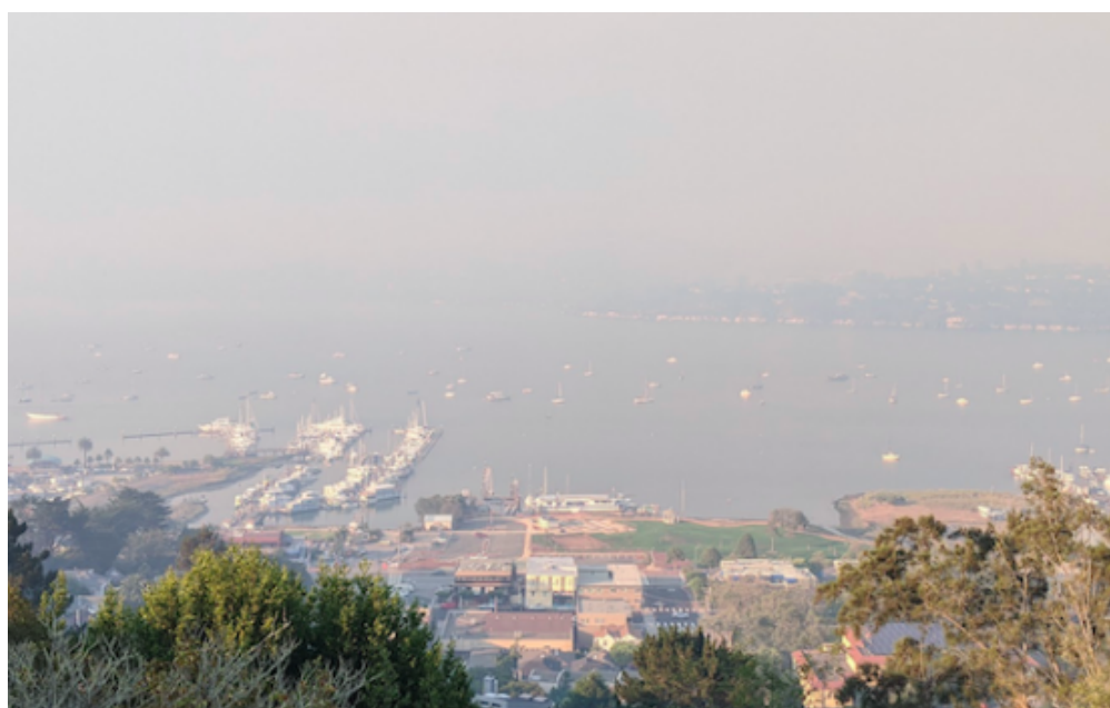
Smoke over Richardson's Bay on Thursday, August 20