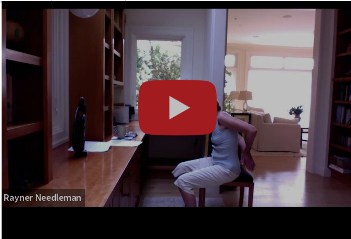
Online Chair Yoga