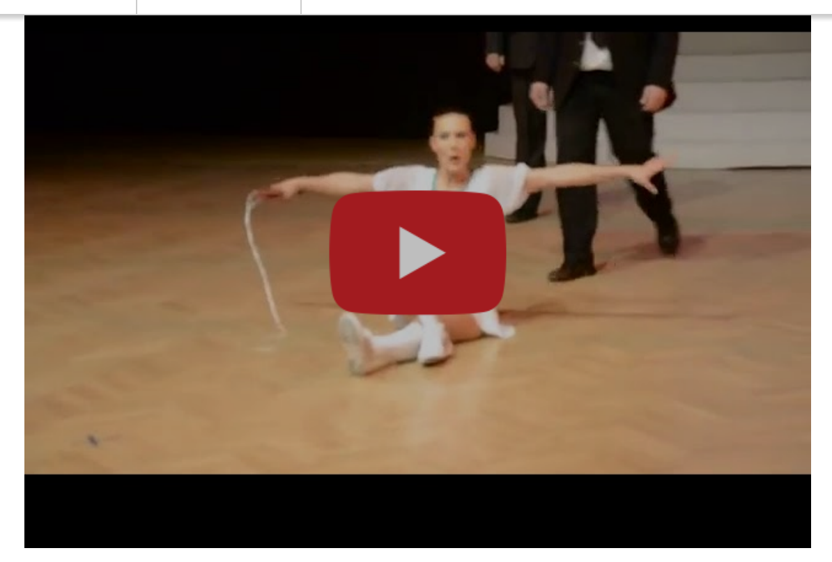
How to use a skipping rope.