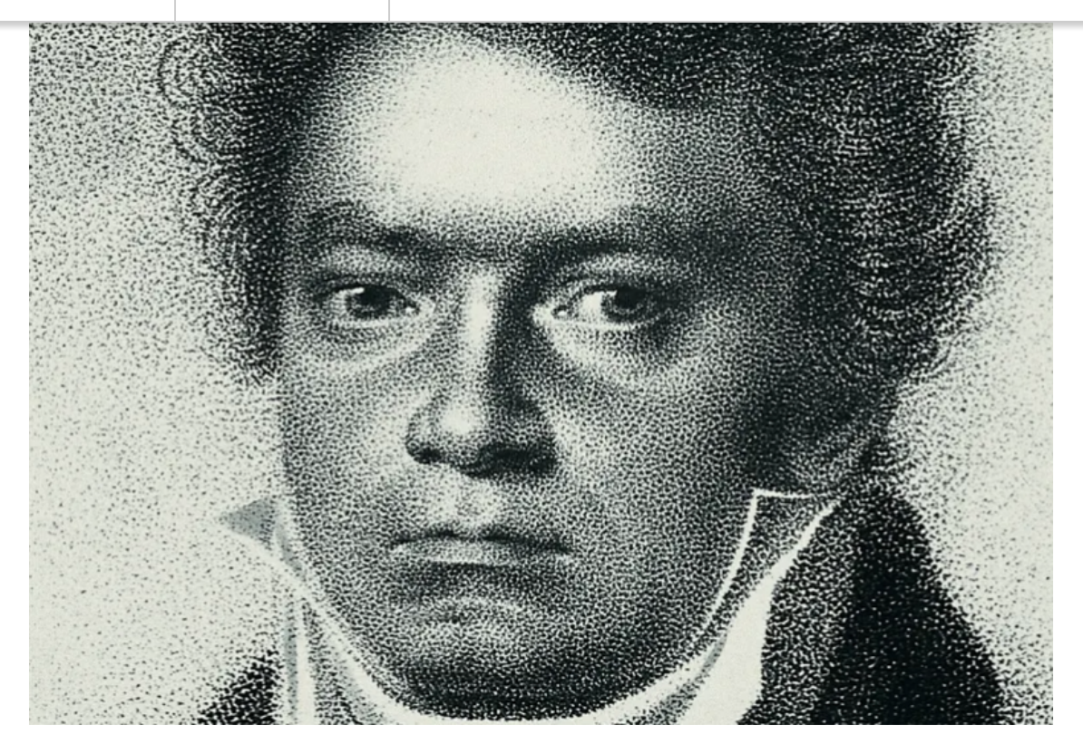
'Beethoven was black':