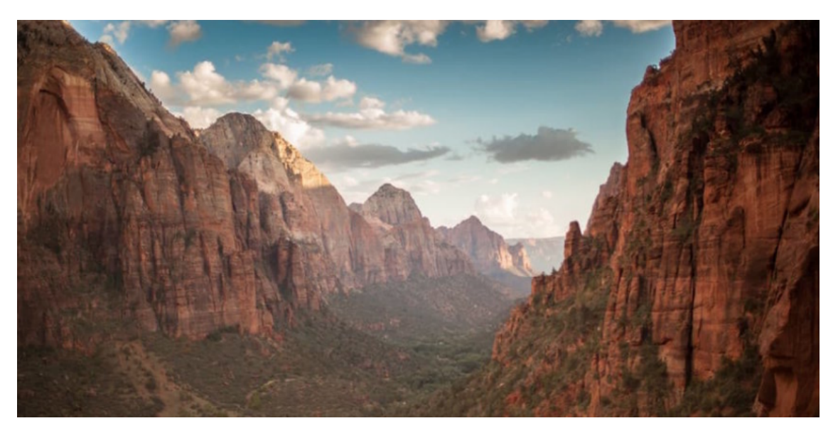
5 U.S. Hikes for People Who Hate Hiking