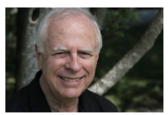
SATURDAY, SEPTEMBER 12TH 7:00EST/4:00PST

Join us for Conversations with Authors, live this weekend.