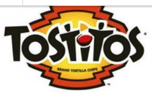
Between the 2nd and 3rd 't's' are 2nd and 3rd "T's" are two people sharing (or fighting over) a tortilla and a bowl of salsa.