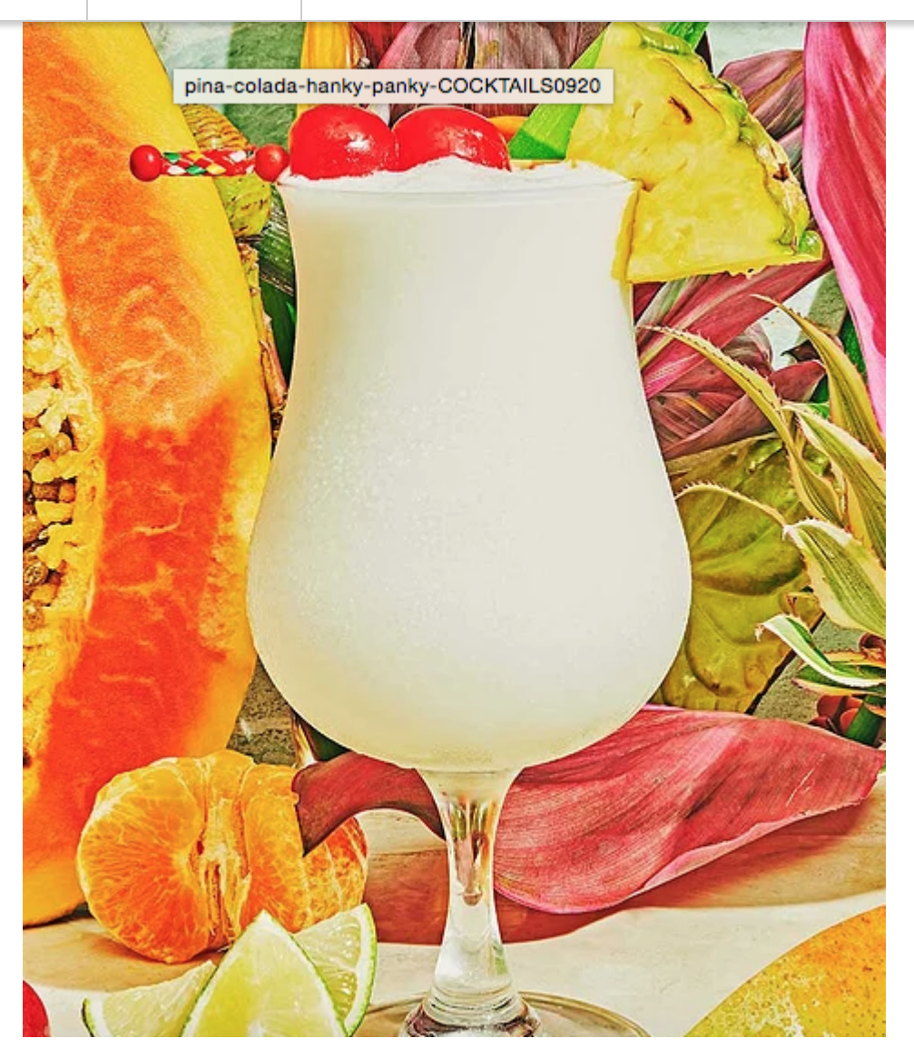
It's Five O'Clock Somewhere: The Fascinating History of Iconic Hotel