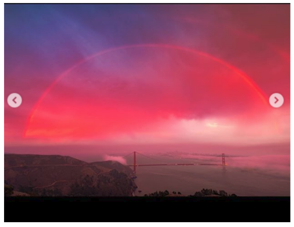
Happy Saturday, Villagers

Please <u>send along</u> your suggestions for materials to add to the daily tips. We're always looking for good content. And visit our <u>website</u> for more information about our organization and programs.