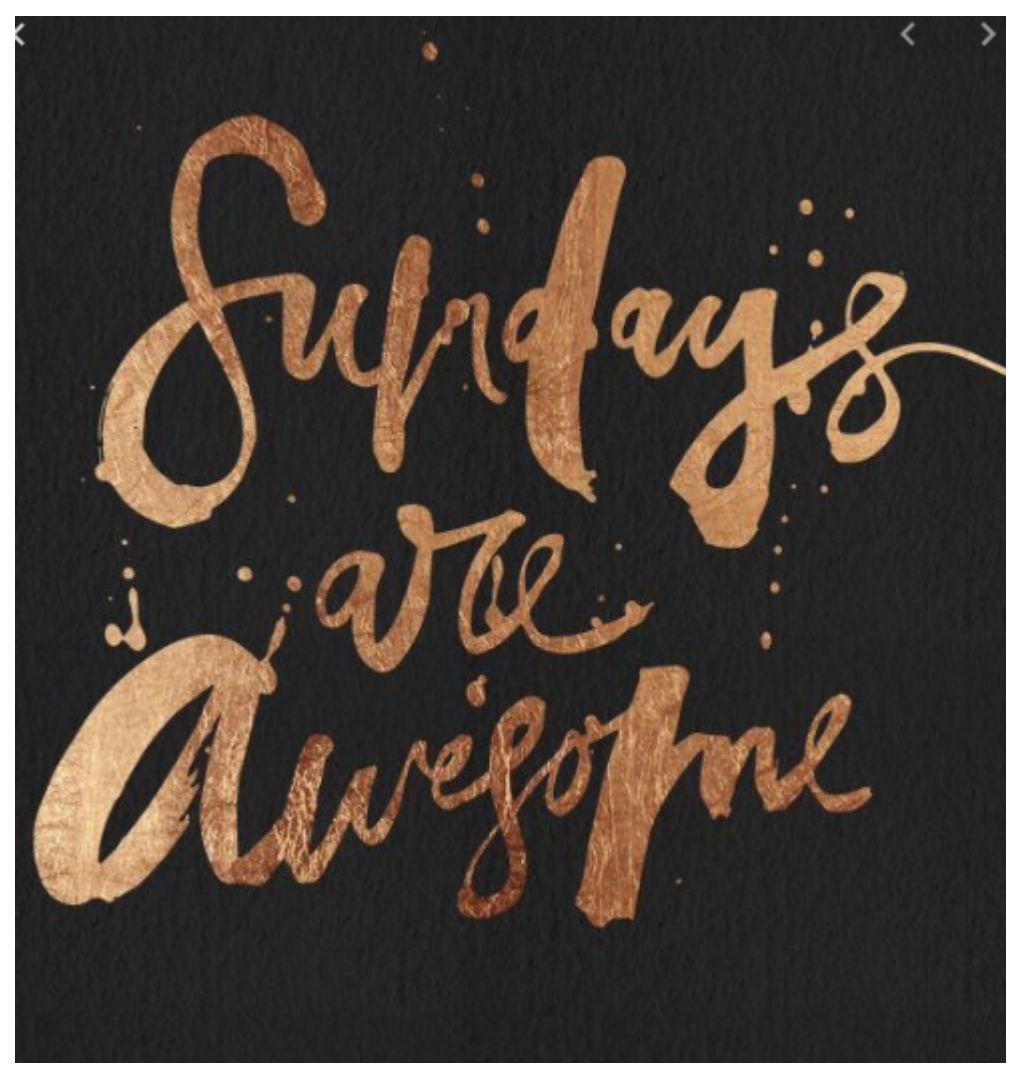
Happy Sunday, Villagers

Please <u>send along</u> your suggestions for materials to add to the daily tips. We're always looking for good content. And visit our <u>website</u> for more information about our organization and programs.