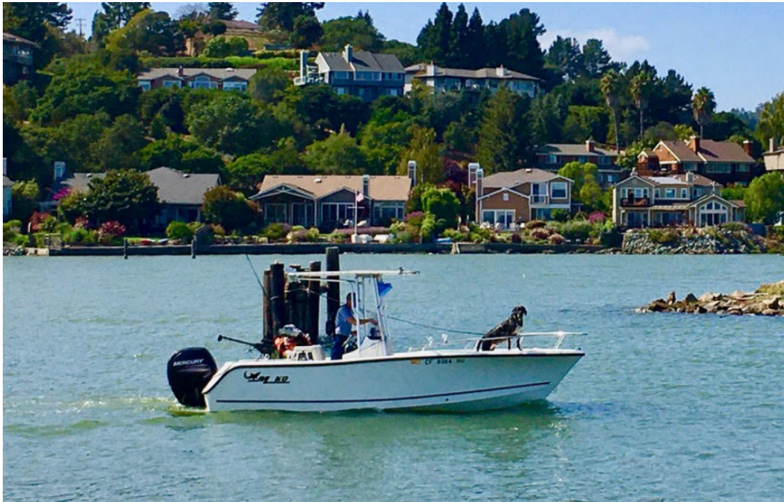
Lock Lomond Marina on a clear day.

Have any pictures you've taken around Marin during COVID? Share them with us.