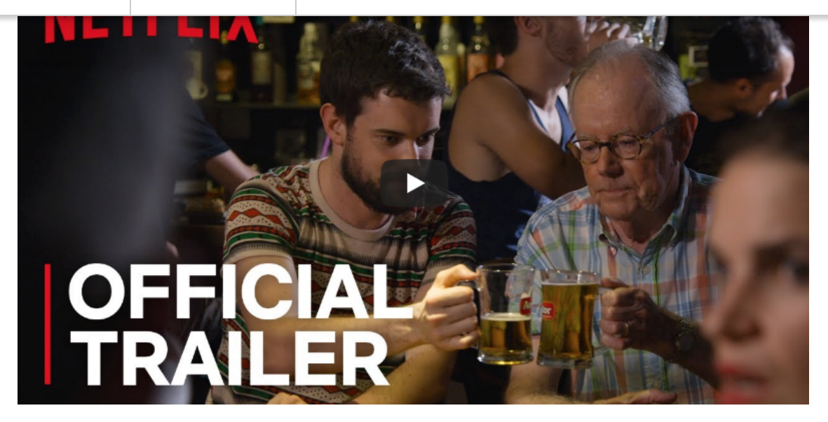
5 Netflix Shows to Inspire Your Next Travel Getaway

Sometimes, a vacation time means grabbing your passport, hopping on a plane and exploring a new destination. But other times, it means staying in bed and throwing on your favorite Netflix show to experience the wonder of travel from the comfort of home. Not every weekend gets to be a travel weekend, but why not take advantage of staying in by watching some travel-inspired shows and getting ready for your next epic adventure.