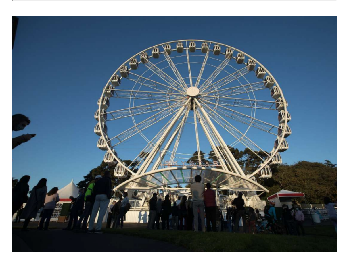
I rode the new Ferris wheel in Golden Gate Park. Here's what it was