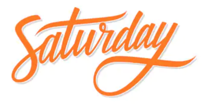
Happy Saturday, Villagers

Please <u>send along</u> your suggestions for materials to add to the daily tips. We're always looking for good content. And visit our <u>website</u> for more information about our organization and programs.