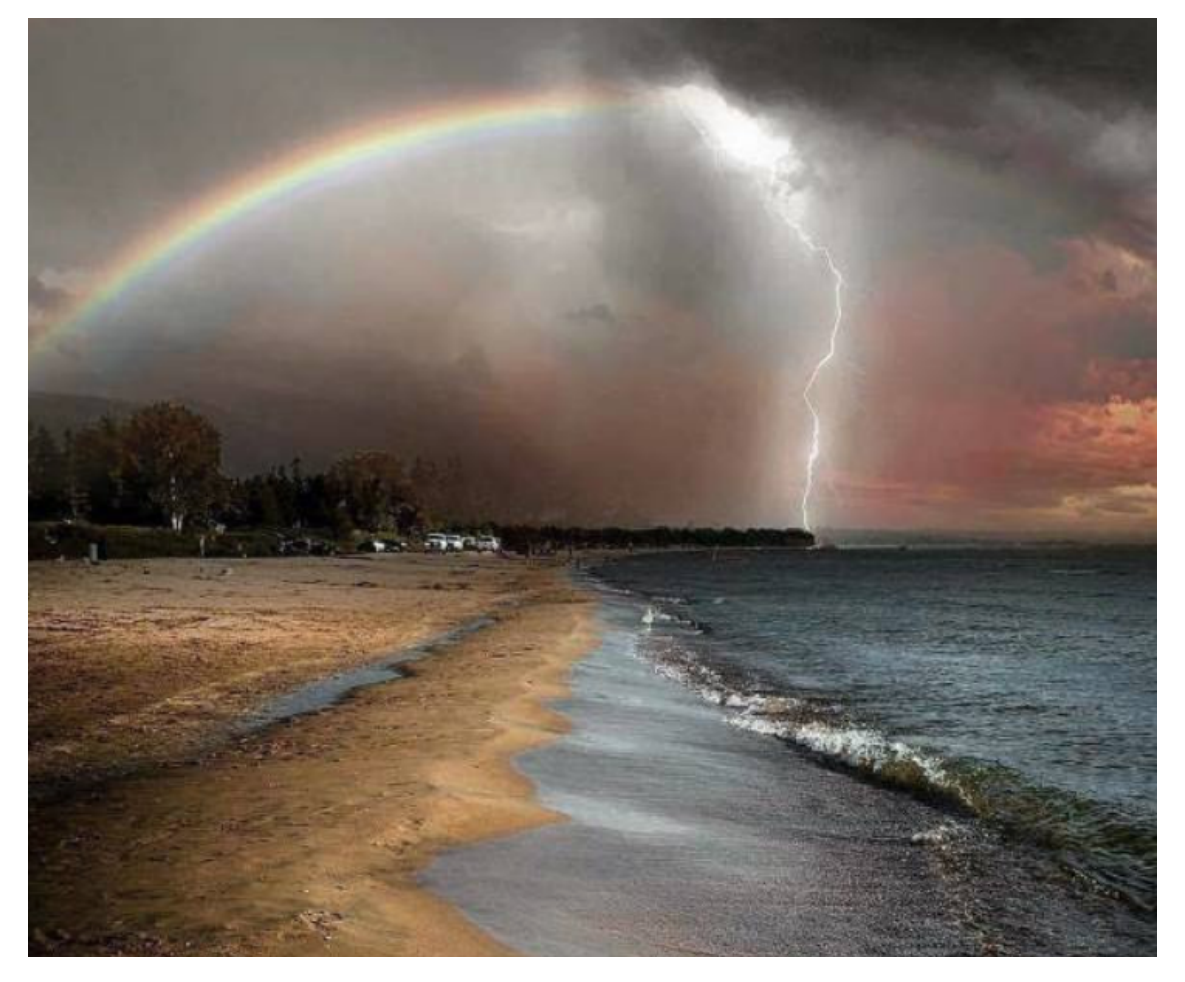
Happy Tuesday, Villagers

Please <u>send along</u> your suggestions for materials to add to the daily tips. We're always looking for good content. And visit our <u>website</u> for more information about our organization and programs.