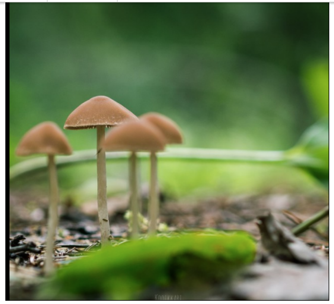
Psychedelic Psilocybin 101: The science of magic mushrooms

After decades of branding as a taboo recreational drug, psilocybin, the key psychoactive compound in magic mushrooms is undergoing a renaissance in scientific research circles. From depression to anorexia and OCD, psilocybin has been labeled with a Breakthrough Therapy designation by the FDA. Here's a primer on the latest psychedelic psilocybin news.