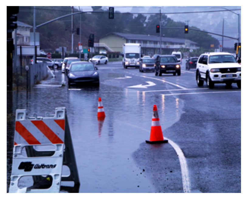
The entrance to the Manzanita Park & Ride Lot in southern Marin is one of the areas that typically floods during king tides, drastically affecting traffic flow.

High tides often cause flooding along shoreline communities and low-lying roadways of Marin County, which can be exacerbated during winter storms. But tide-related flooding can happen whether it's raining or not. Such inconveniences are likely to occur over the next few months and may begin as soon as Friday, November 13.