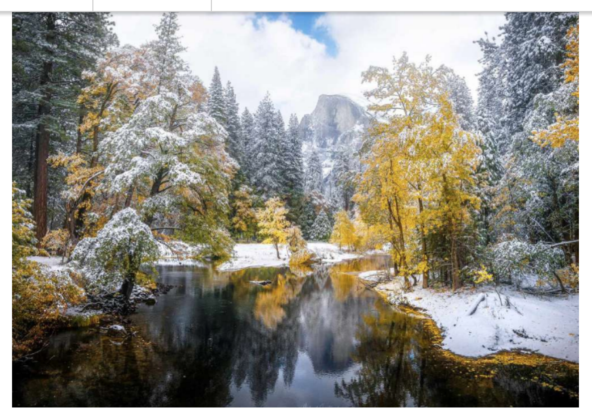
When snow meets fall: Beautiful photos capture 'snowliage' in