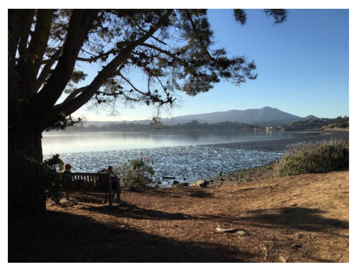
Happy Thursday, Villagers

Please <u>send along</u> your suggestions for materials to add to the daily tips. We're always looking for good content. And visit our <u>website</u> for more information about our organization and programs.