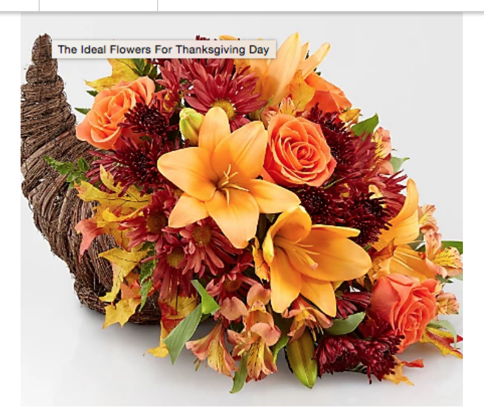
How to celebrate Thanksgiving alone and actually enjoy it

The holidays will feel different this year. Try these four expert tips for making the most of the season.