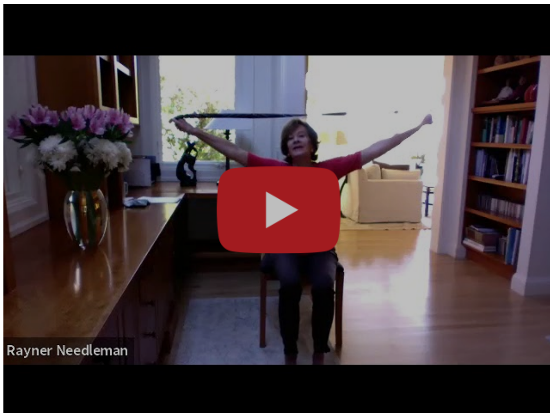
Online Chair Yoga