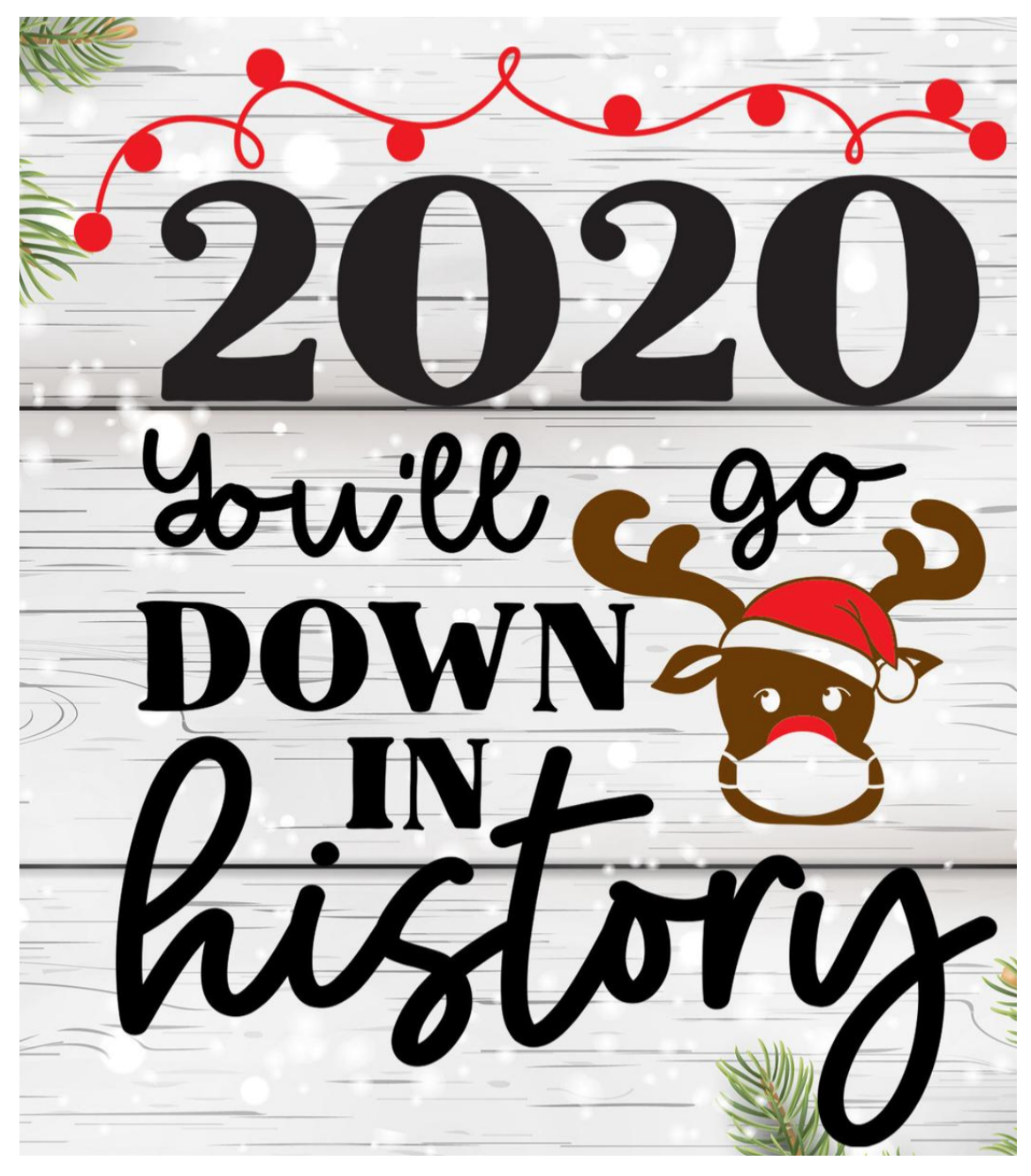
Happy Friday, Villagers

Please send along your suggestions for materials to add to the daily tips. We're always looking for good content. And visit our website for more information about our organization and programs.