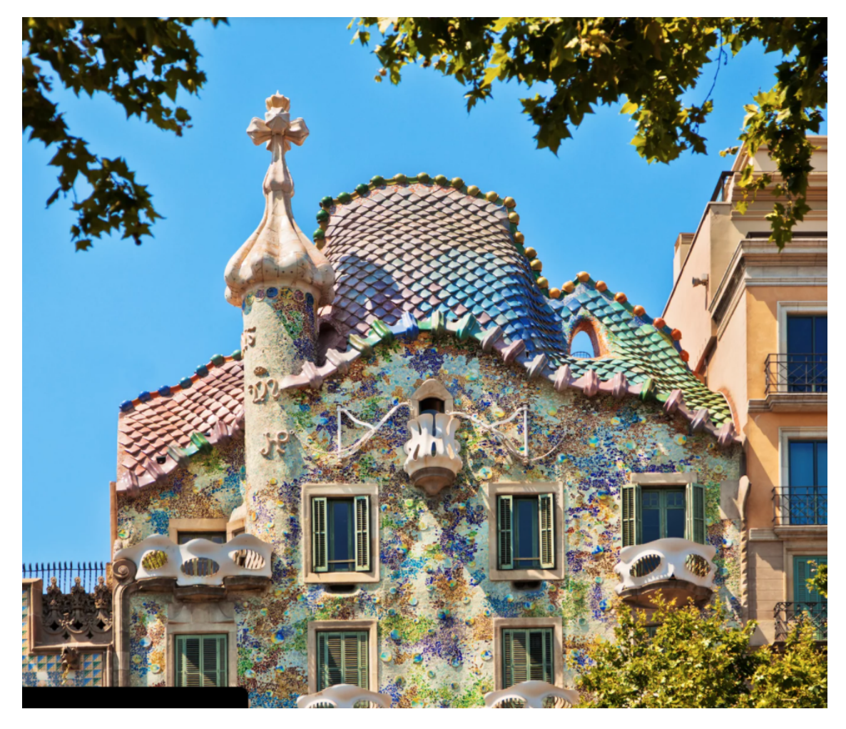
Experience Barcelona From Home With This