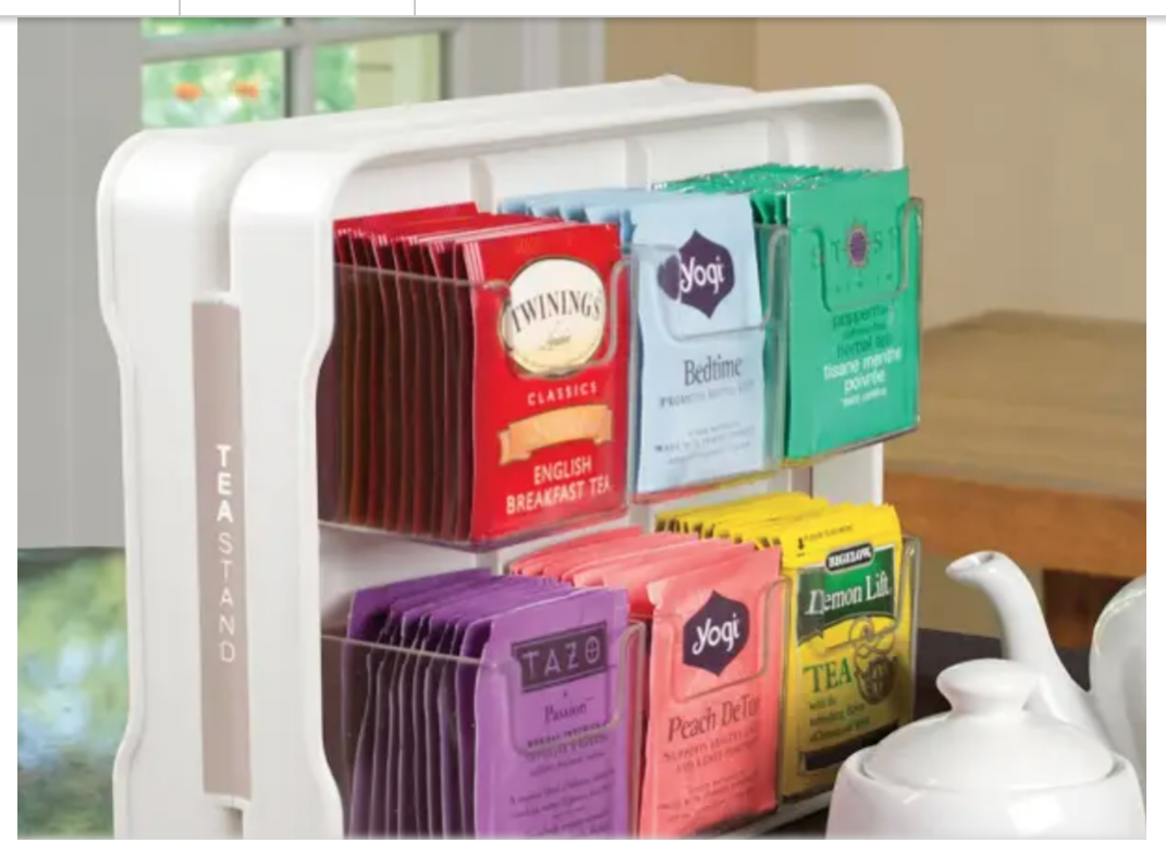
<u>Things That Will Magically Give Your Home</u> <u>More Space In 2021</u>