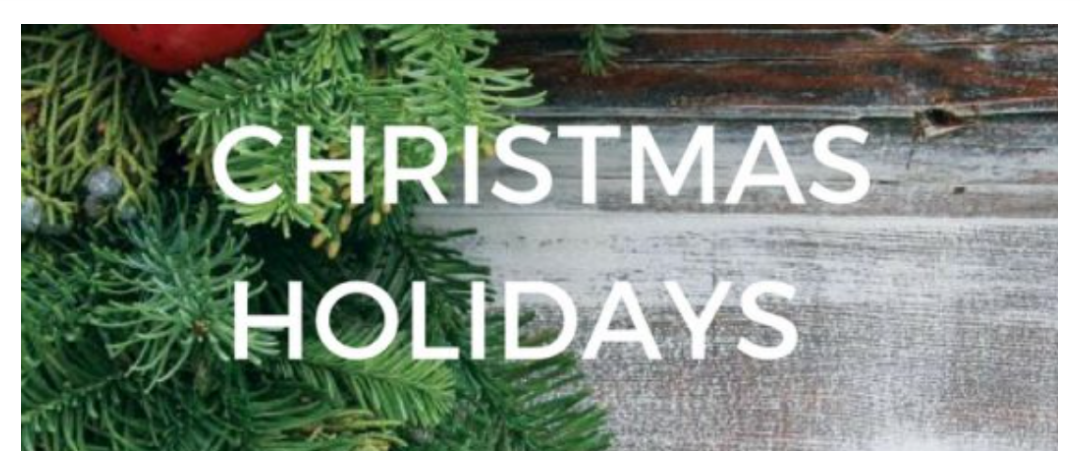
Happy Monday, Villagers

Please <u>send along</u> your suggestions for materials to add to the daily tips. We're always looking for good content. And visit our <u>website</u> for more information about our organization and programs.