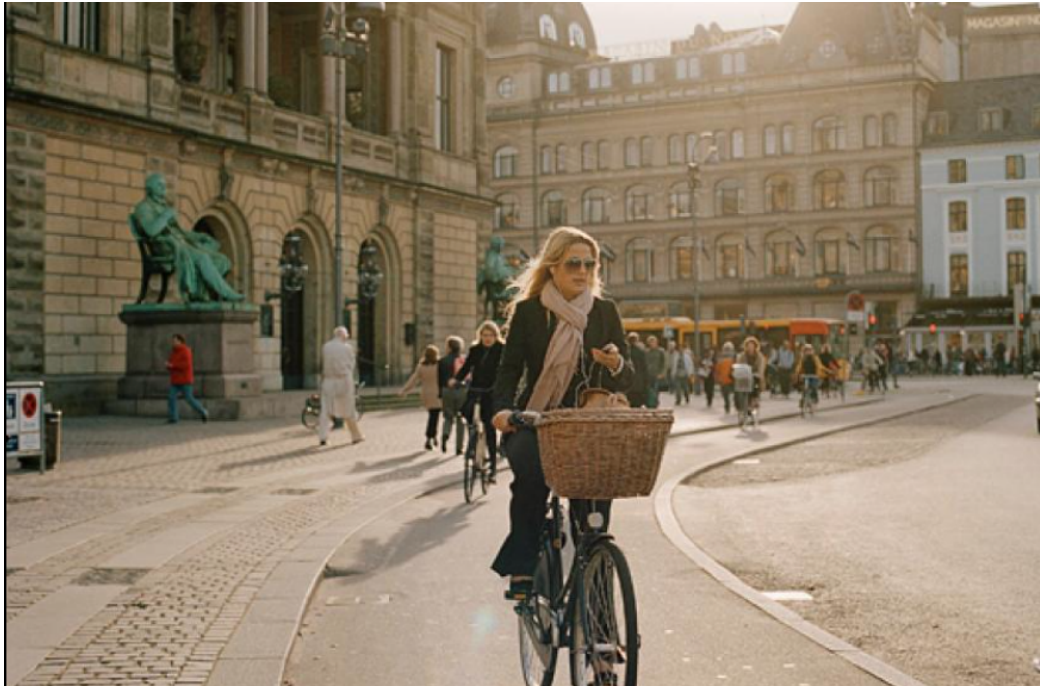
Is joy the same in every language?