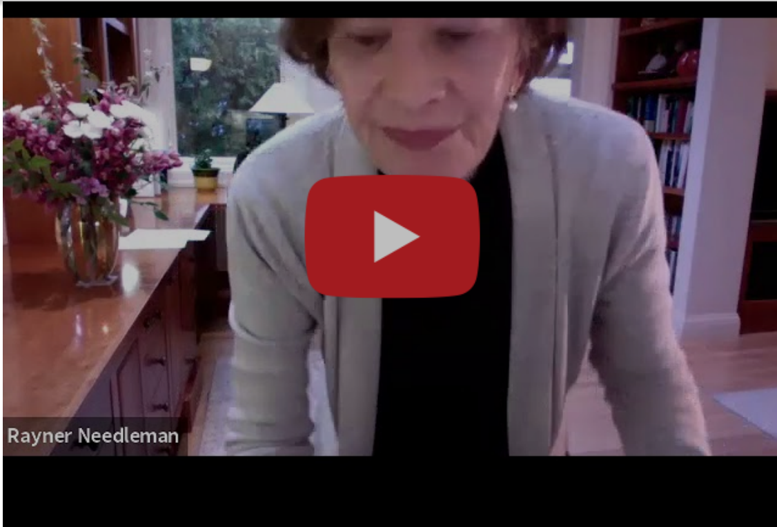
Online chair yoga.