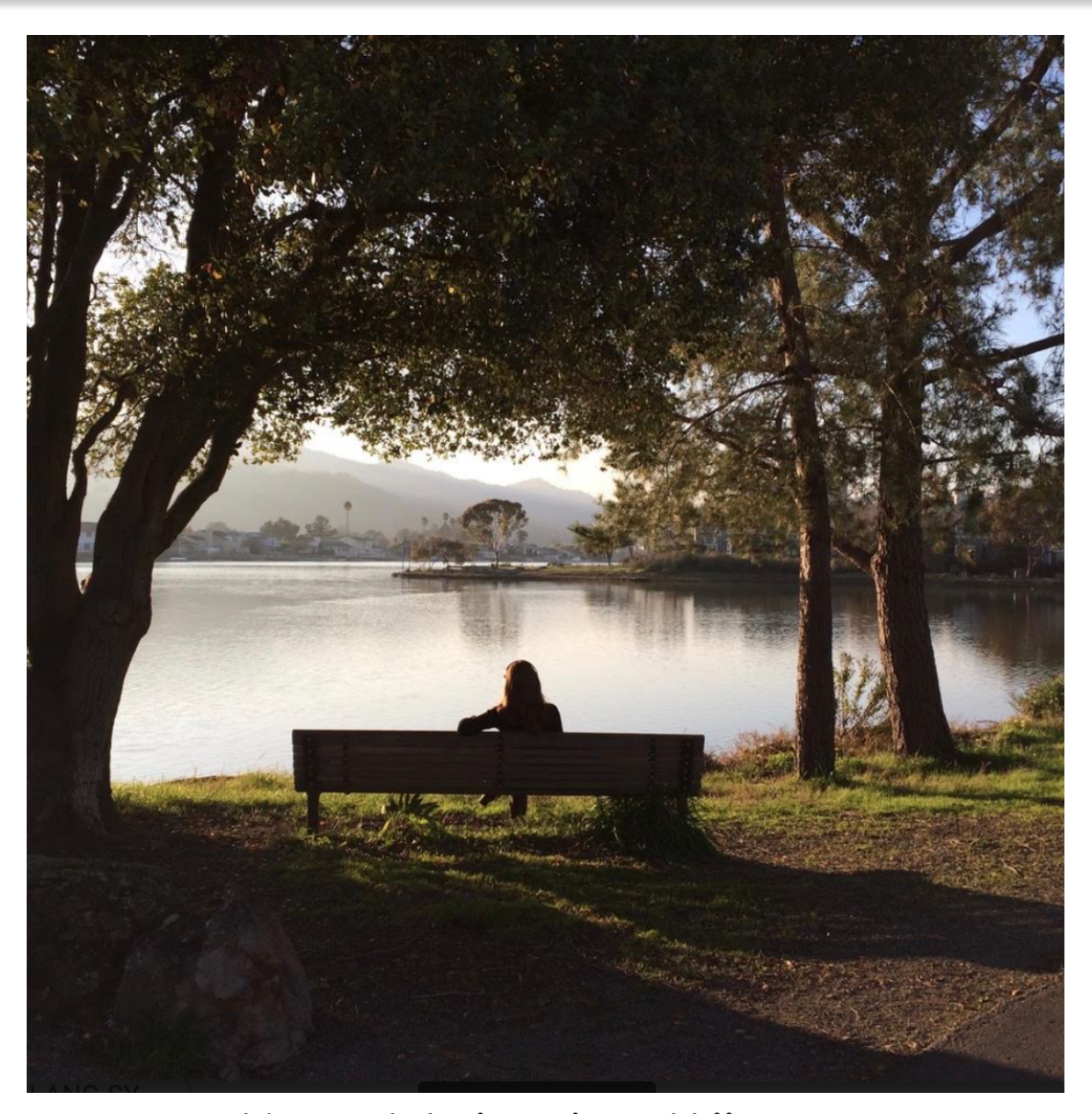
Happy Wednesday, Villagers

Please <u>send along</u> your suggestions for materials to add to the daily tips. We're always looking for good content. And visit our <u>website</u> for more information about our organization and programs.