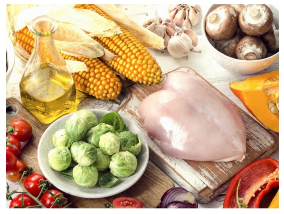
What Eating Healthy Looked Like 50 Years Ago

Eating healthy sounds like a concept that should be pretty simple, right? If you're someone who tries to eat healthy, you know that while that should be the case, it isn't always completely black and white. What one expert recommends, another swears is outdated and incorrect. What we thought was true about health in the past is suddenly all wrong.